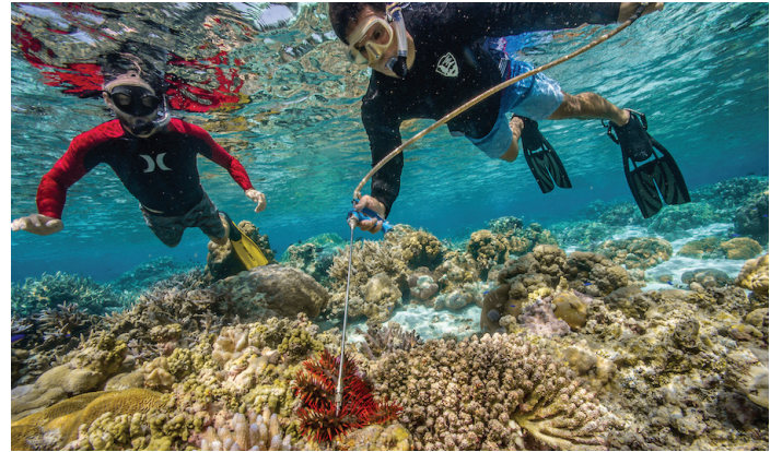
Predator removal of the Crown of Thorns seastar, Acanthaster planci , from National Park American Samoa