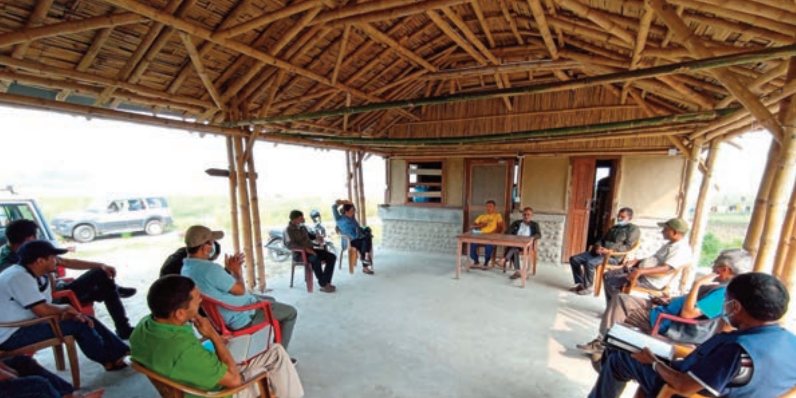
Conducting a meeting with stakeholders on tiger conservation