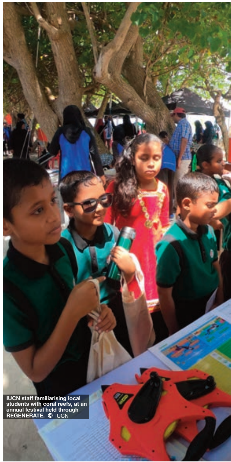
IUCN staff familiarising local students with coral reefs, at an annual festival held through REGENERATE.

The REGENERATE project successfully mainstreamed evidence-based conservation efforts, expanded the protected area network, supported ecosystem and species conservation, and demonstrated the economic advantages of preserving ecosystems. The collaborative efforts of the Ministry of Environment, Climate Change and Technology (MoECCT), Ministry of Fisheries, Marine Resources and Agriculture, Maldives Marine Research Institute, Environmental Protection Agency, and Maldives National University were instrumental in achieving these remarkable outcomes, enhancing the resilience of the Maldives' coastal resources in the face of climate change. MoECCT became a State Member of IUCN in April 2022, making it the sole State Member in the world to join throughout the year.