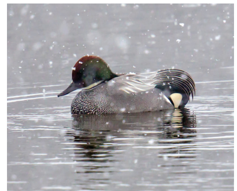
Falcatid Duck ( Mareca falcata), Near Threatened

By the end of 2020, we envisage: (1) significant improvements in the implementation of actions plans for key threatened taxa (working with partners including the Threatened Waterfowl SG) - Baer's Pochard, Scaly-sided Merganser, Long-tailed Duck and Velvet Scoter; (2) improved knowledge of the conservation status of ducks in key flyways, particularly the East Asian-Australasian flyway; (3) improvements in sustainable management of huntable ducks in Europe, especially Common Pochard, through collaborative projects with game management organisations and authorities; (4) improved understanding of the scale of duck hunting in other global flyways; (5) development of a more diverse membership, particularly in under-represented regions such as South America and Australasia; (6) maintenance of communication tools; (7) provision of guidance on best practice for fieldwork methods, particularly telemetry techniques.