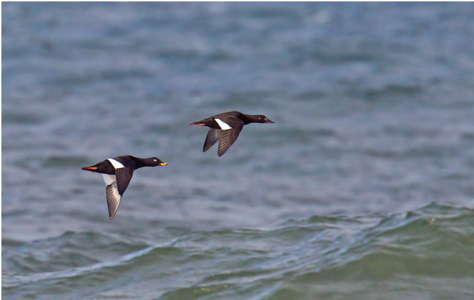
Velvet Scoter ( Melanitta fusca), Vulnerable