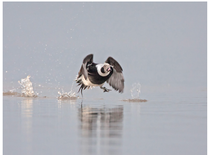
Long-tailed Duck ( Clangula hyemalis), Vulnerable