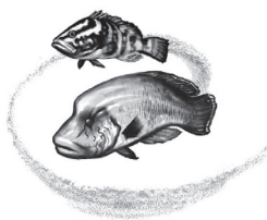
Grouper & Wrasses Specialist Group

Website: (IUCN hosted) Grouper and Wrasse Specialist Group