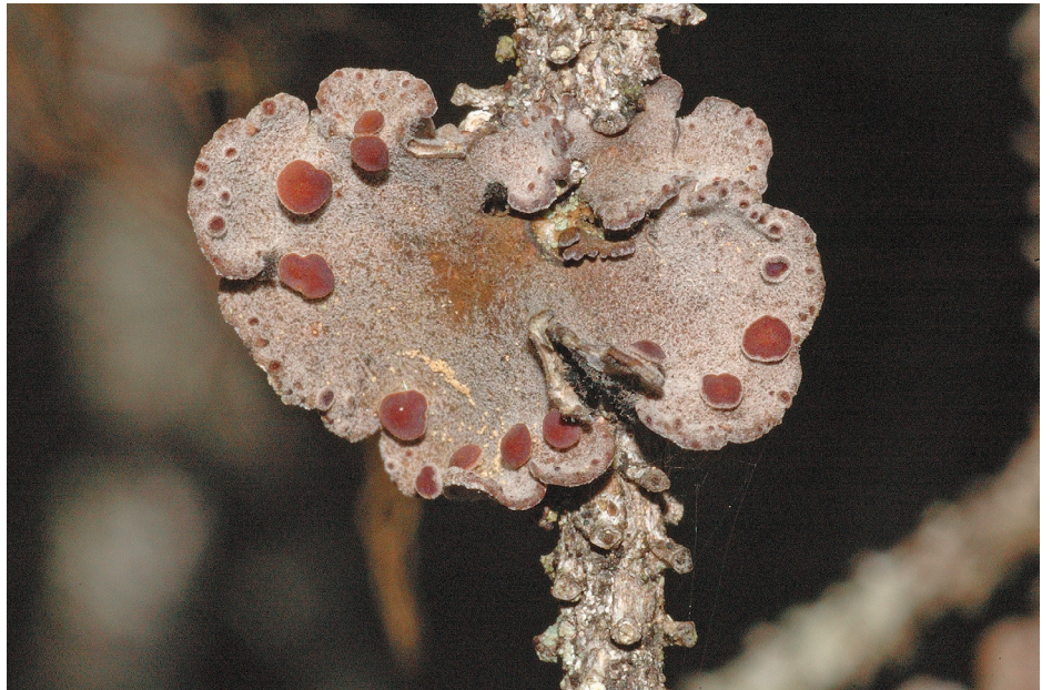
Erioderma pedicellatum , Critically Endangered, Alaska