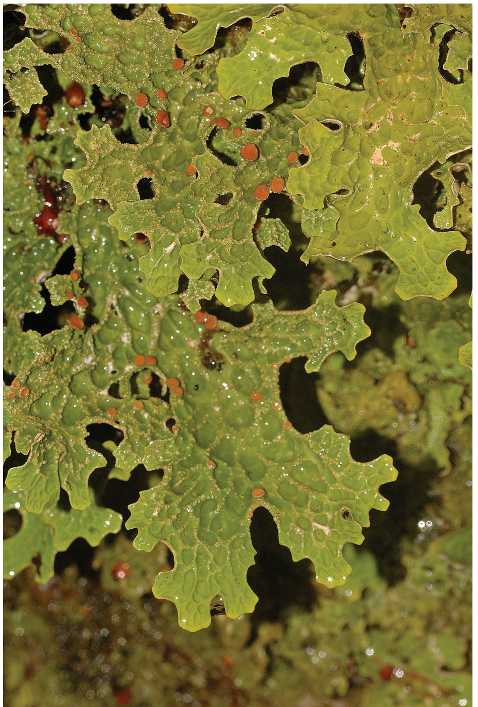
Lungwort lichen ( Lobaria pulmonaria )