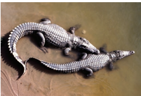
Siamese Crocodile ( Crocodylus siamensis )