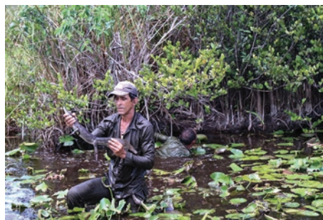
Caiman crocodilus fuscus in Cuba