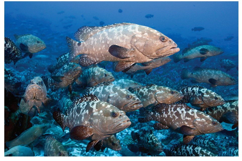
Vulnerable Camouflage Grouper Epinephelus polyphekadion in spawning aggregation, French Polynesia

and United Nations Food and Agriculture Organization (FAO). (KSR #26)