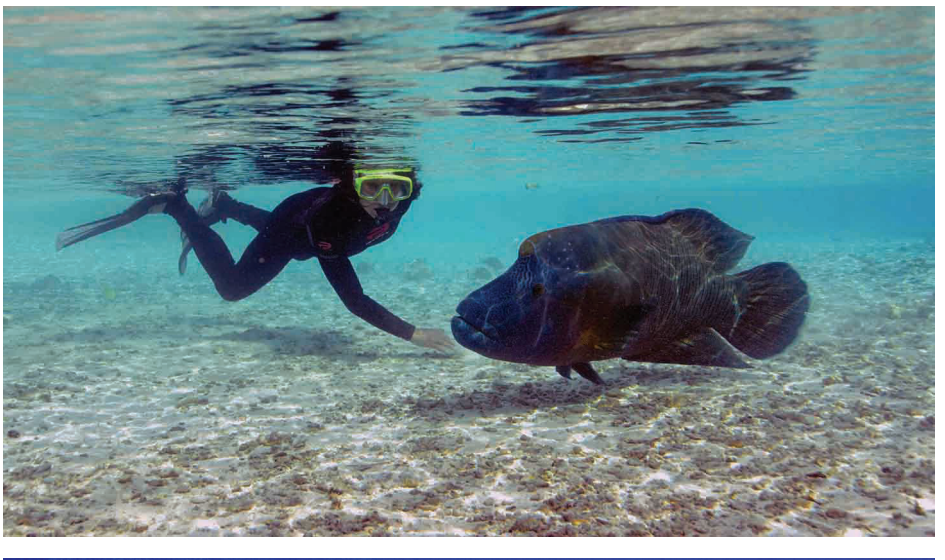
Cheilinus undulatus , Endangered