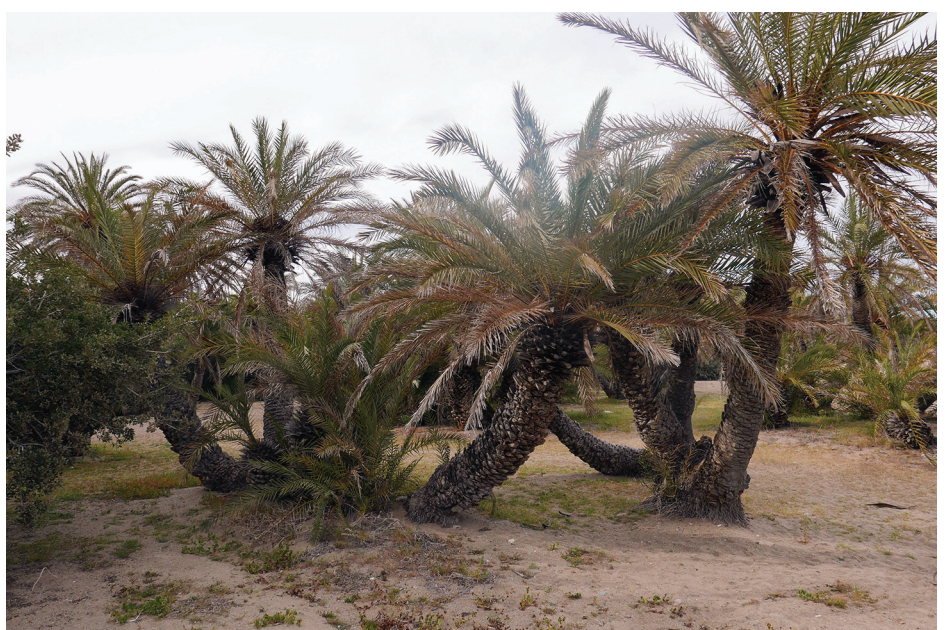
Near Threatened Theophrastus's Date Palm, Phoenix theophrasti Greuter