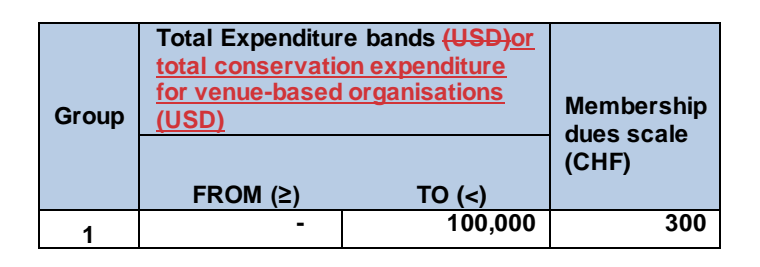
Table 5: National and international non-governmental organisations and Indigenous peoples' organisations

If a Member does not submit the information required, the Secretariat will use the latest financial statements available from public sources to determine the level of total expenditure of the Member. Failing that, the organisation will be reclassified into the dues group immediately above the one it is currently in.