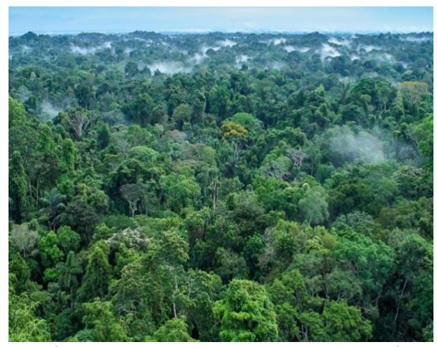
Example of a carbon-rich, high biodiversity tropical rainforest Yasuni National Park, Ecuador

UNFCCC COP 27 underlined"... the urgent need to address in a comprehensive and synergistic manner, the interlinked global crises of climate change and biodiversity loss in the broader context of achieving the Sustainable Development Goals, as well as the vital importance of protecting, conserving, restoring and sustainably using nature and ecosystems for effective and sustainable climate action" (CMA 4 para 1),