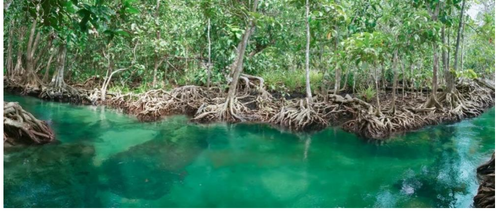
Example of a carbon-rich, high biodiversity mangrove forest Krabi, Thailand.

All pathways to attaining the Paris Agreement target of limiting average global temperature increases to well under 2°C above pre-industrial levels require protecting the global carbon sinks and reservoirs in natural ecosystems, in addition to rapid and drastic declines in GHG emissions. One fundamental and well-recognized tool is the protection of carbon-rich ecosystems such as primary forests, peatlands, grasslands, coastal blue carbon and marine biota, as well as the restoration of lost and damaged terrestrial, freshwater, coastal and marine ecosystems. These ecosystems are often referred to as 'carbon-rich' because they sequester and store more carbon than other ecosystems.