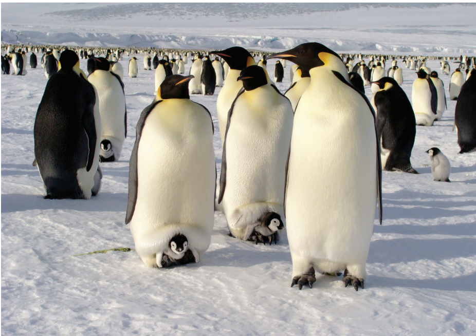
Emperor penguin ( Aptenodytes forsteri ), Near Threatened