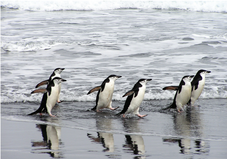
Chinstrap penguins ( Pygoscelis antarcticus )