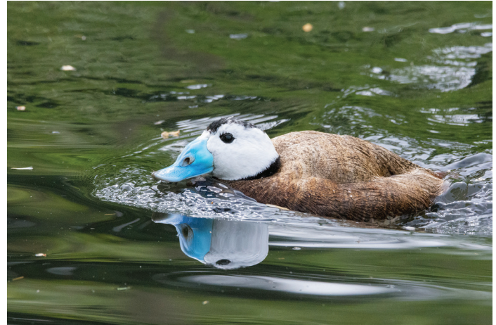
White-headed Duck ( Oxyura leucocephala ), Endangered. Major threats are due to competition and hybridisation with the non-native North American Ruddy Duck ( Oxyura jamaicensis )