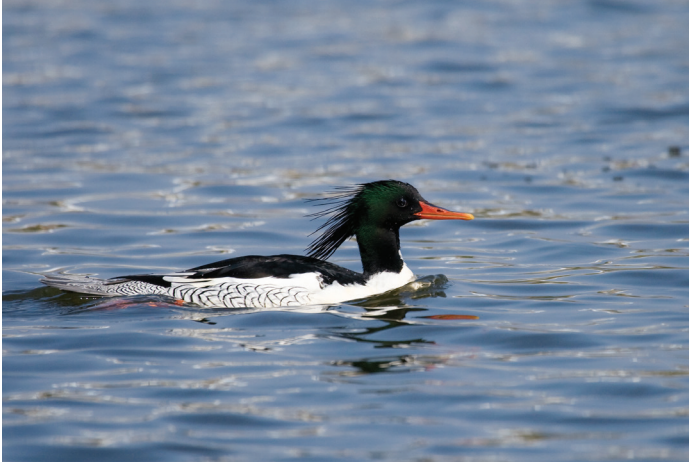
Male scaly-sided Merganser ( Mergus squamatus ), Endangered