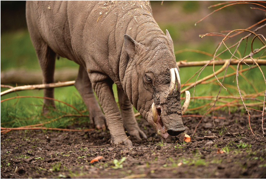
Babirusa ( Babyrousa babyrussa), Vulnerable

Team of the Tamaraw Conservation Program and Chester Zoo setting a camera trap to find Oliver's warty pig, as a preparation for a planned project on Oliver's warty pigs