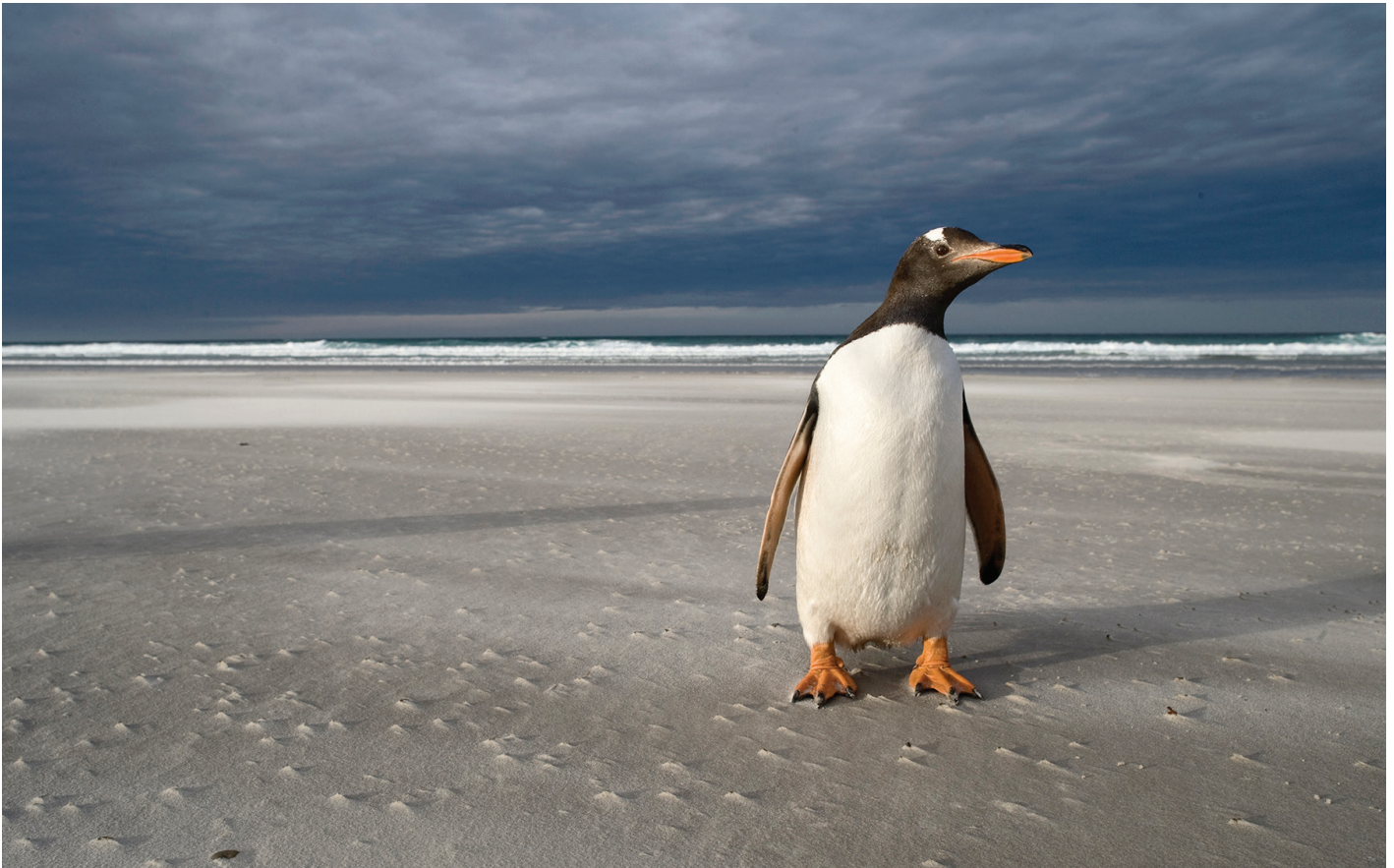
Gentoo Penguin