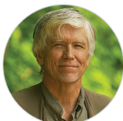
Russell A. Mittermeier