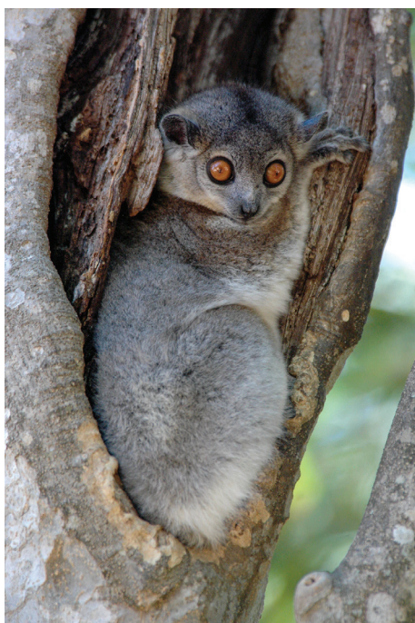
White-footed Sportive Lemur ( Lepilemur leucopus ), Endangered, in daytime sleeping site (tree hole), Berenty, Madagascar