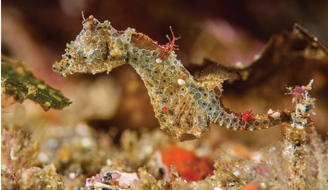
Hippocampus japapigu