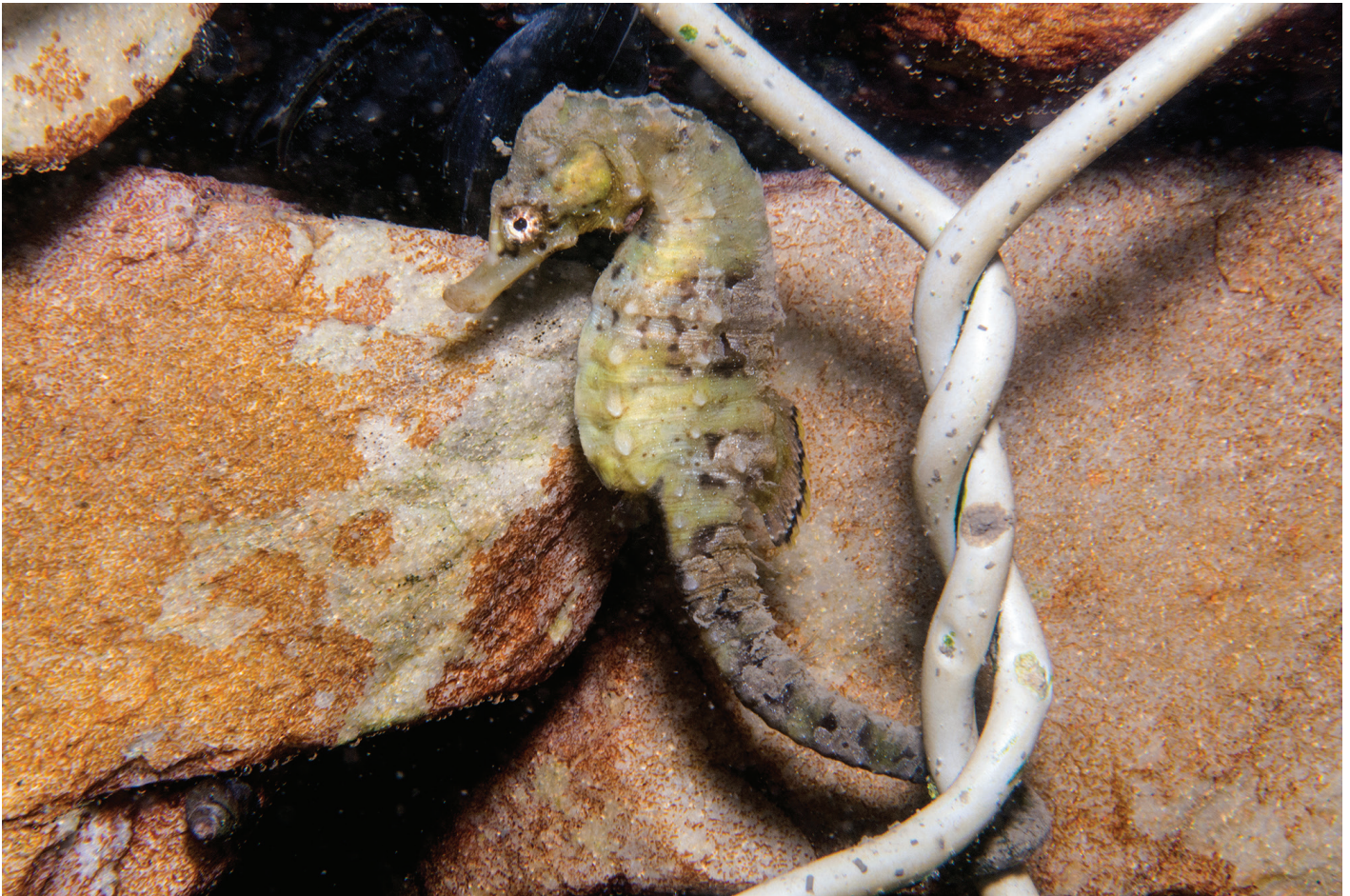
Hippocampus capensis