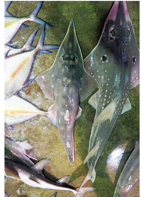
Critically Endangered Clown Wedgefish Rhynchobatus cooki , Singapore Fishing Port