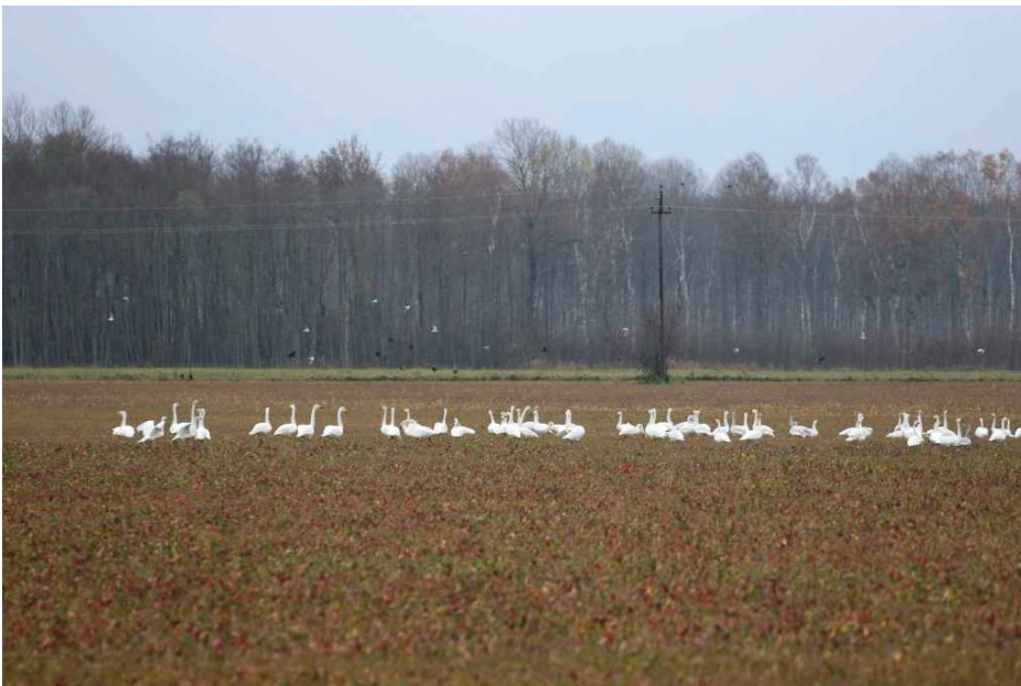
Bewick's Swans, Cygnus columbianus bewickii , in Estonia during post-conference excursion

iii. Ongoing monitoring of trends in migratory swan populations in North America, coordinated by the US Fish and Wildlife Service (USFWS), also continued with 2017 census results published in 2018. (KSR #12)