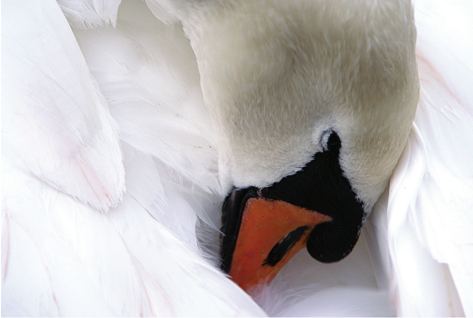
Mute Swan, Cygnus olor