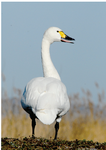
Bewick's Swan, Cygnus columbianus bewickii