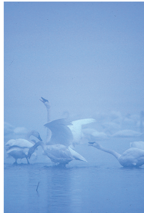
Tundra Swans in triumph display