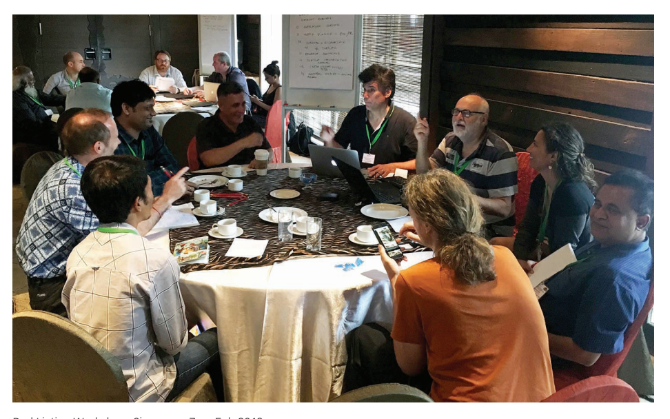
Red Listing Workshop, Singapore Zoo, Feb 2018