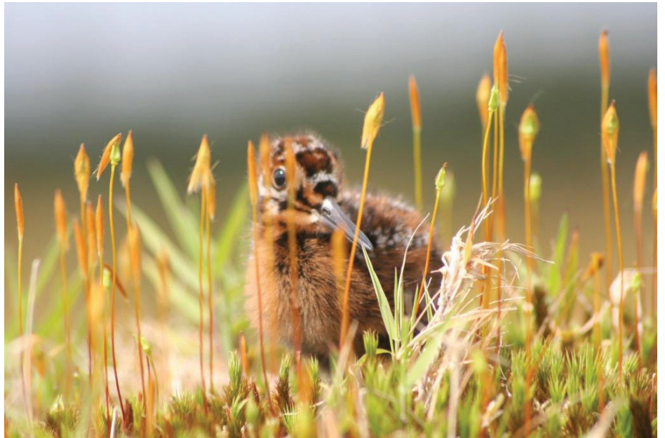
Common Snipe chick ( Gallinago gallinago), Least Concern