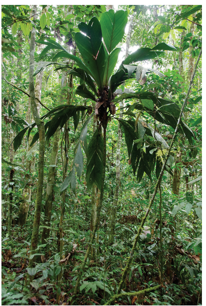
Geonoma triglochin , Yasuni, Ecuador