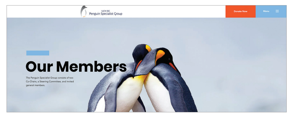
Screenshots of our website www.penguinsg.org