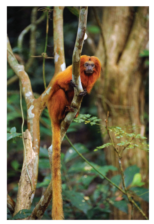
Endangered Golden Lion Tamarin, Leontopithecus rosalia, Fazenda Apetiba, State of Rio de Janeiro, Brazil