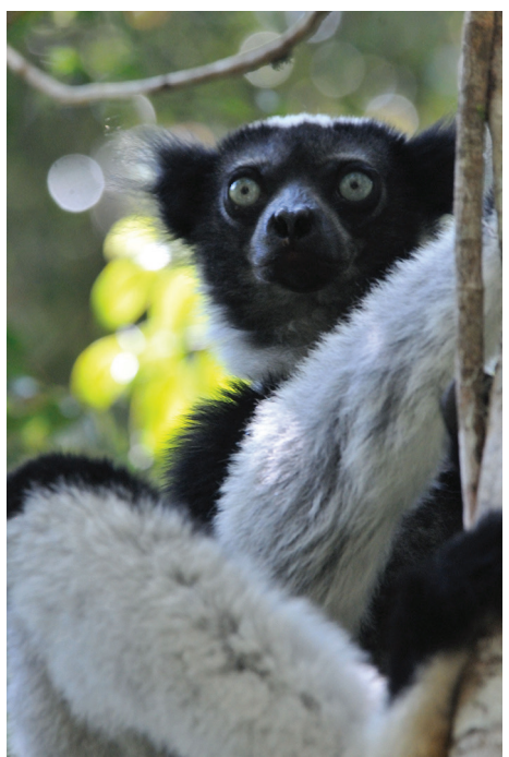
Critically Endangered Indri, Indri indri , Special Analamazaofra Reserve, Andasibe, Madagascar