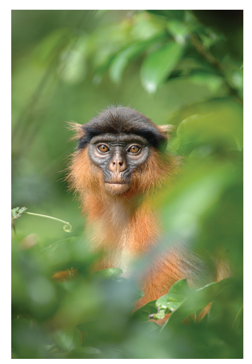
Endangered Temmincki's Red Colobus, Piliocolobus badius temminckii, Abuko Nature Reserve, Gambia Photo: Russell A. Mittermeier

Endangered Mountan Gorilla, Gorilla beringei beringei, female with four month old, Democratic Republic of Congo Photo: Russell A. Mittermeier