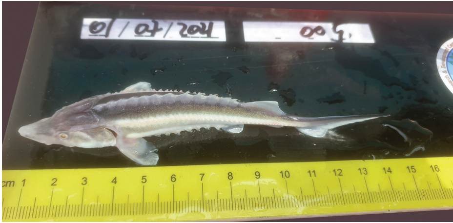
Young of the year wild Beluga ( Huso huso ) caught in Danube