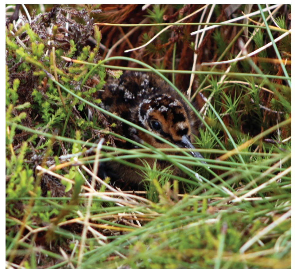
Least Concern Common Snipe, Gallinago gallinago