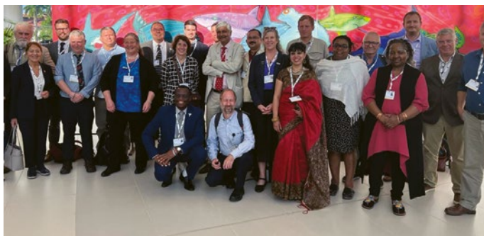
IUCN delegation at CoP 19 CITES

Result description: In 2022 the AsESG submitted four funding proposals and is in discussion with a few others for generating funds for the group.