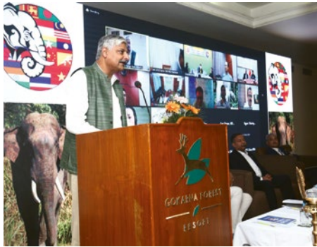
Third Asian Elephant Range State meeting