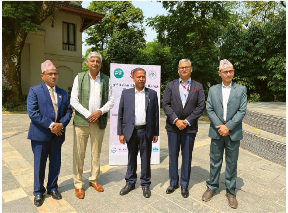
Third Asian Elephant Range State meeting