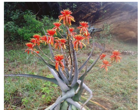
Aloe elata VU B2ab(iii)

Result description: In 2022, the Eastern Africa Plant Red List Authority published 437 plant assessments from 80 different families, including the Endangered trees Dichaetanthera verdcourtii A.Fern. & R.Fern and Mansonia diatomanthera Brenan, both endemic to Tanzania and threatened by urban development, agriculture and logging.