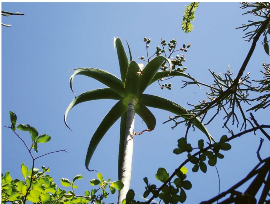
Aloe elata VU B2ab(iii)