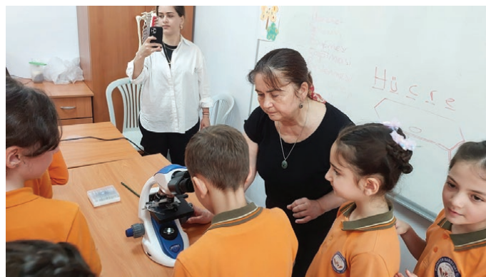
Mite courses in Nature School, Samsun, Turkey