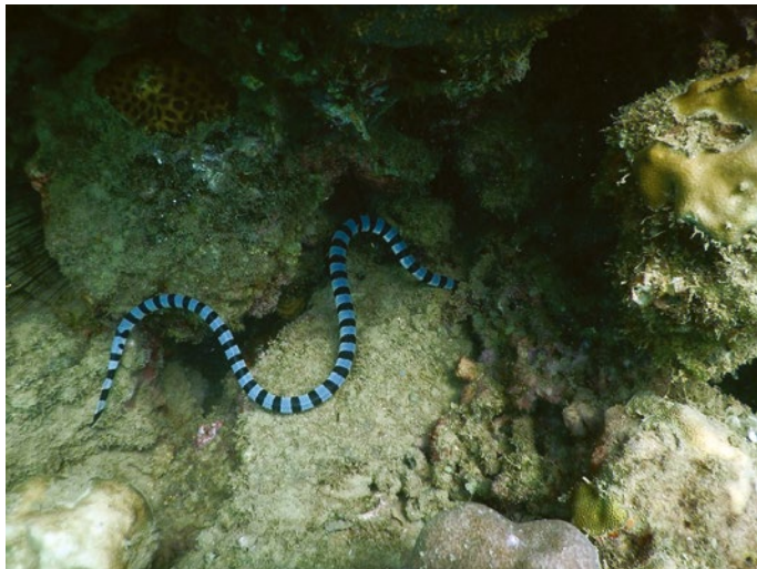
Sea snake at Andaman Islands