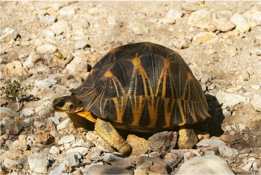
Radiated Tortoise ( Astrochelys radiata ), Tsimanampetsotsa National Park, Madagascar