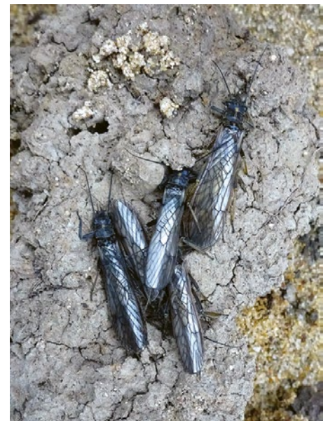
Adults of the rare stonefly Isogenus nubecula

complete for c. 80,000 specimens. The remainder will be transcribed using a citizen science approach.