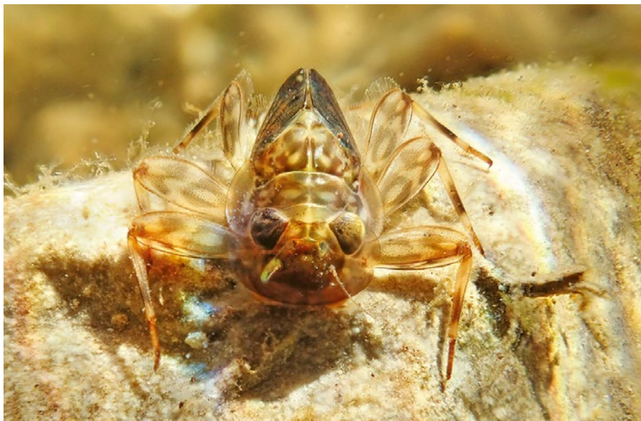
Larva of the mayfly Ecdyonurus sp.