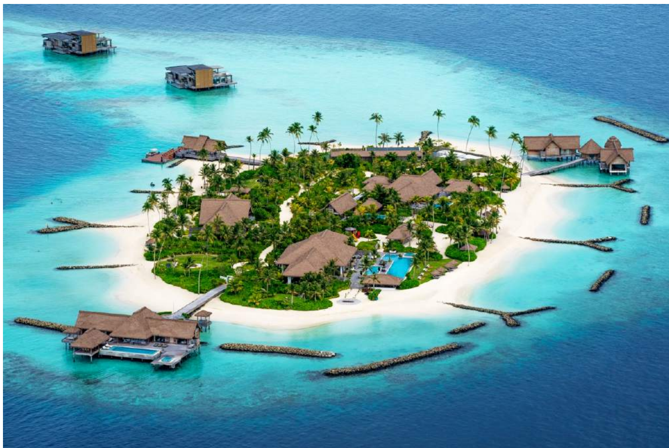
Private resort island, Ithaafushi, Maldives.