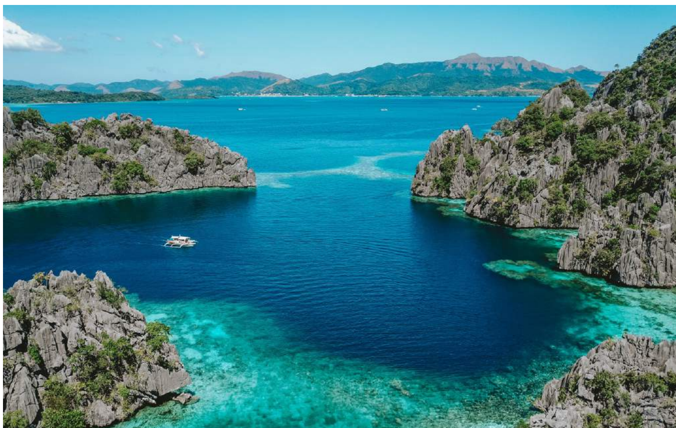
Coron, Philippines.