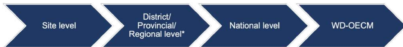
Figure 1. Flowchart of a potential national reporting process, from the site level to reporting the site to the WD-OECM. *This step may not always be needed, depending on the country, or it could even include additional sub-levels