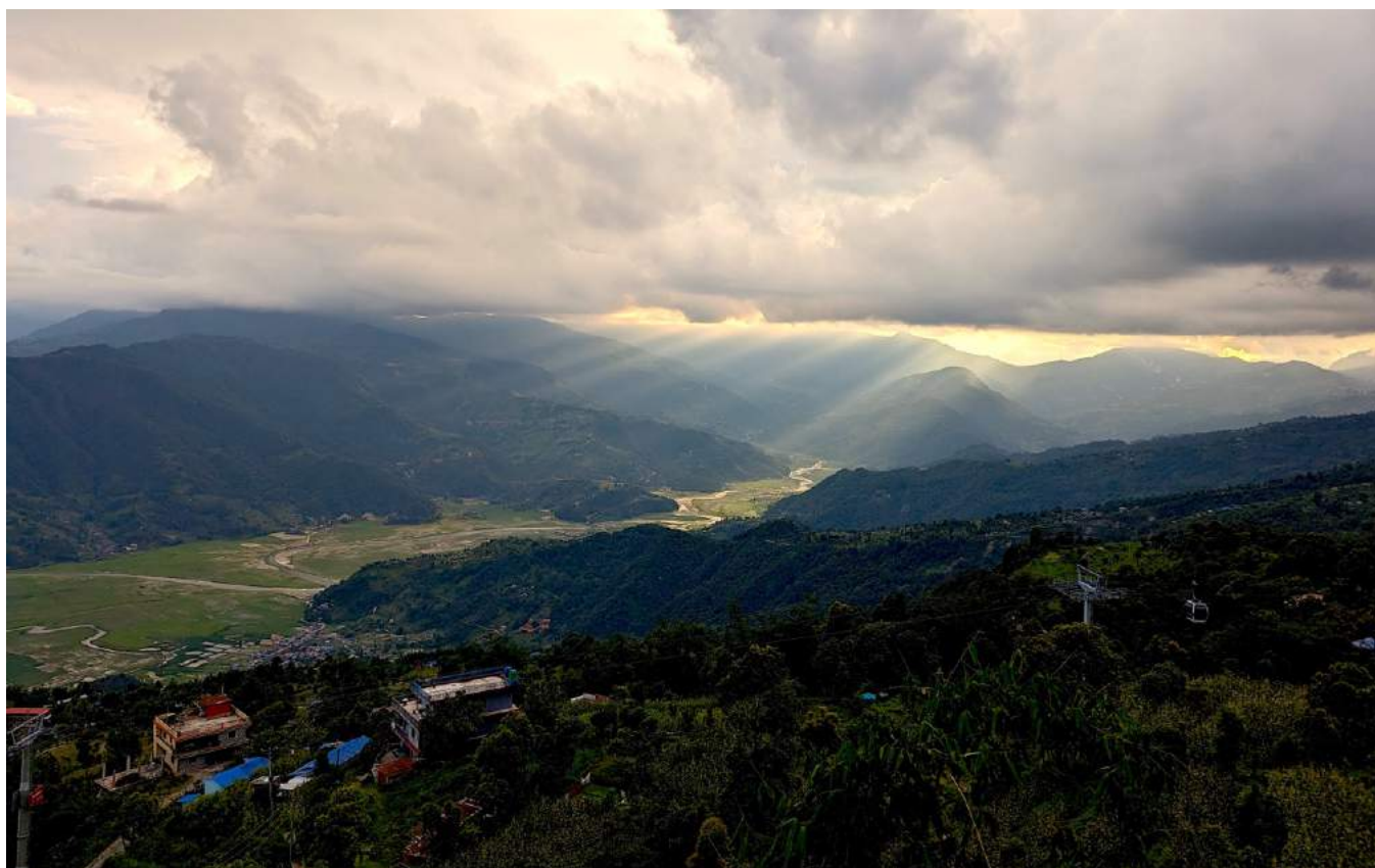
Pokhara, Nepal.

Efforts in this region will have a significant impact on biodiversity conservation globally, as Asia is known to have immense biodiversity and host several of the world's ecological hotspots and threatened species. Hence, safeguarding areas in this region, whether as PAs or OECMs, is a critical step towards making progress on several relevant KM GBF targets, particularly Target 3, and preserving important biodiversity values.