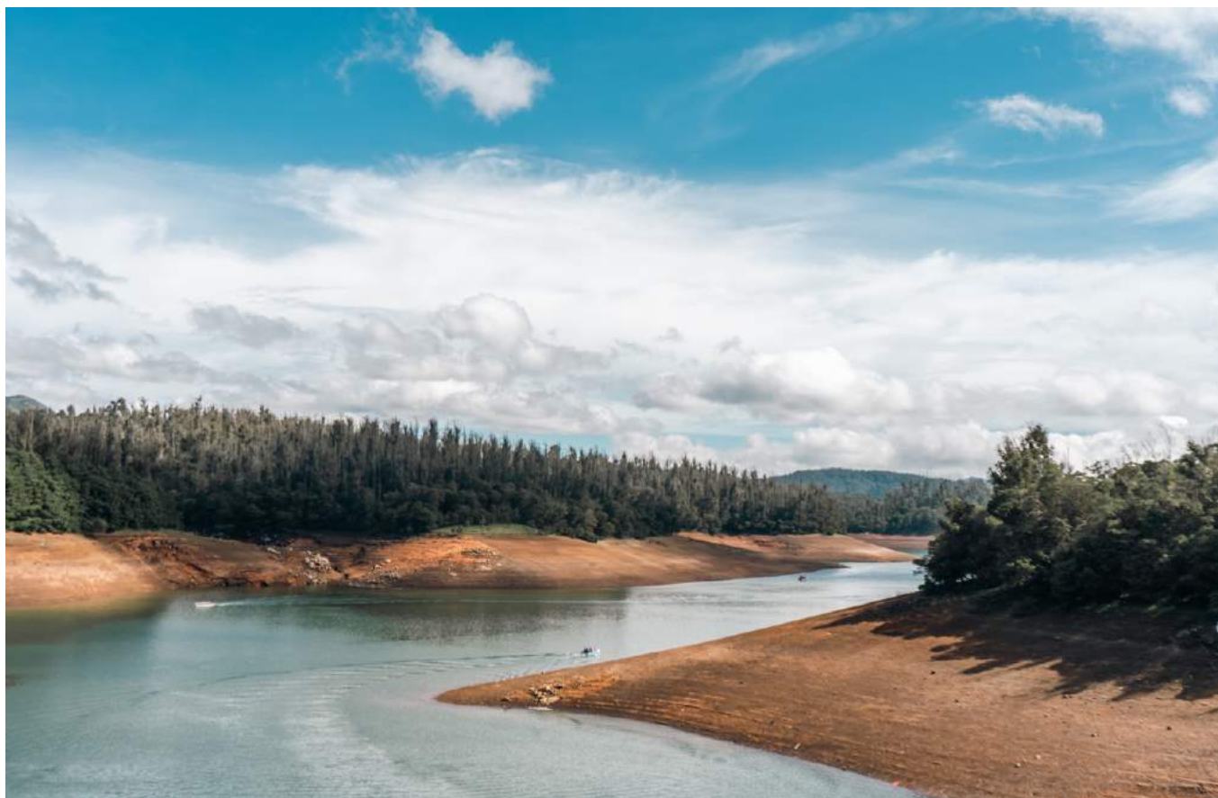
Ooty, Tamil Nadu, India.