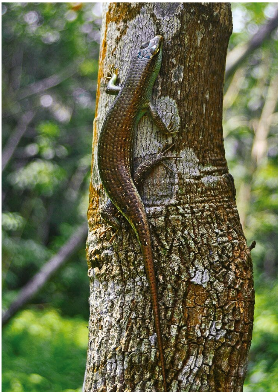
Olive Tree Skink ( Dasia olivacea ), climbing young Rubber Tree. From jungle rubber plantation (agroforest) in Merangin, Jambi, Sumatra, Indonesia