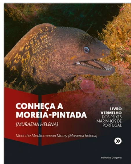
Social media post about species being assessed on the Red Book of Marine Fishes