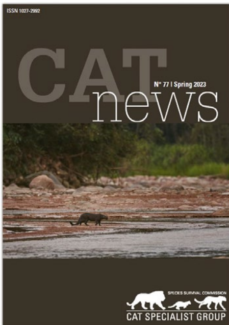
Cat News issues 77 and 78