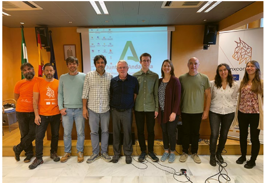
Iberian Lynx Workshop participants

(November 2023). Interventions and inputs into discussions were contributed as they arose. CMS Scientific Council meeting (July 2023) was attended to present the listing proposals for Eurasian Lynx and Manul.