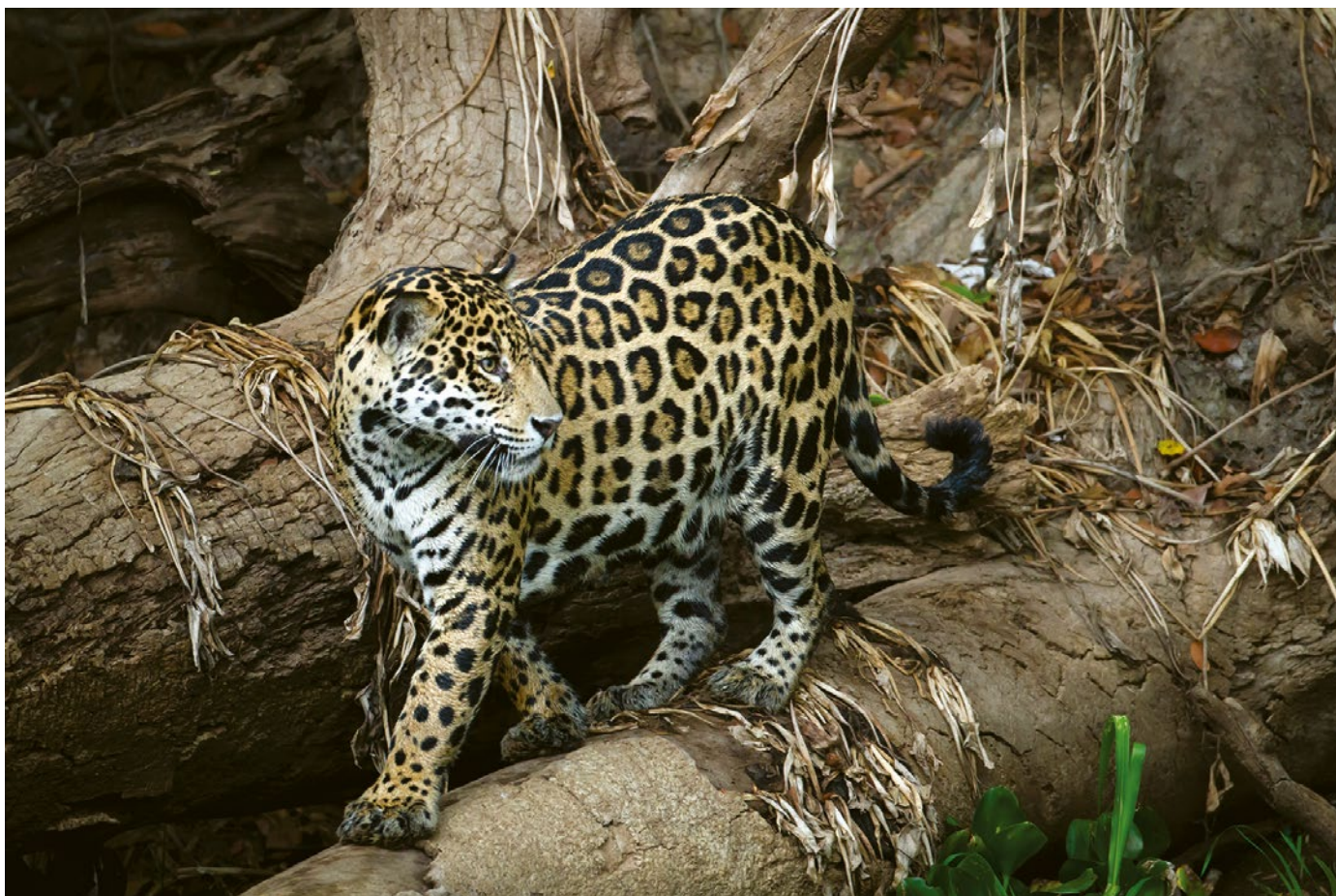
Jaguar ( Panthera onca) in the Pantanal

and integrate these records into the Cat Specialist Group Species Database (CSGSD, used for Red List distribution maps).