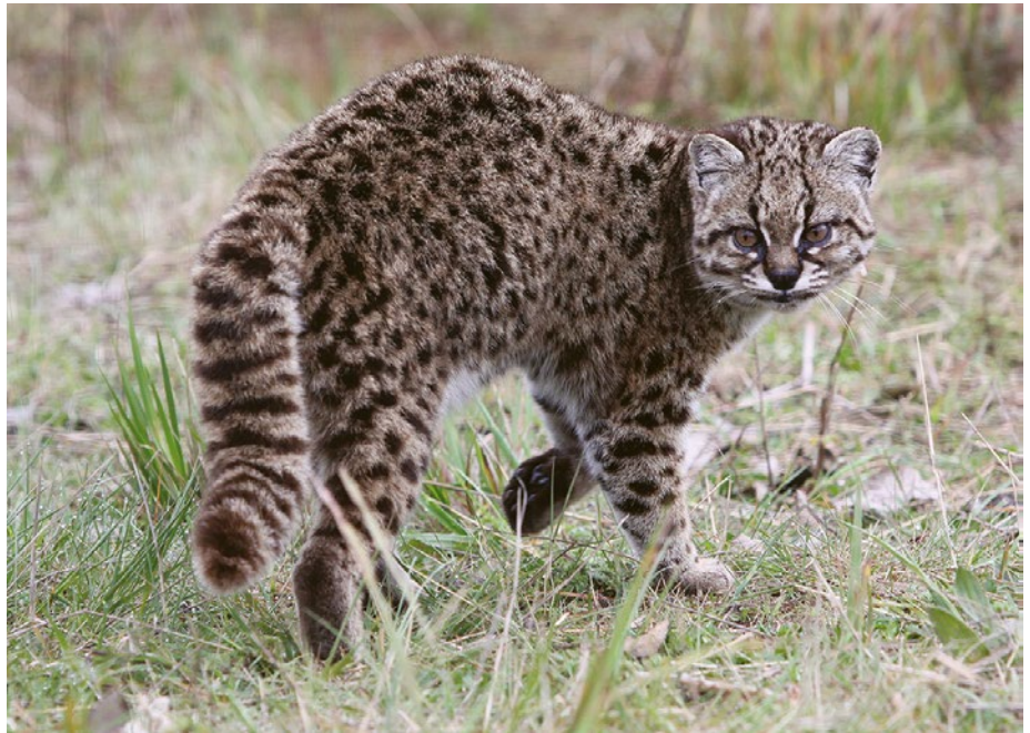
Kodkod ( Leopardus guigna )

Non-IUCN bodies with which the SSC group collaborates to advance targets: Ongoing.