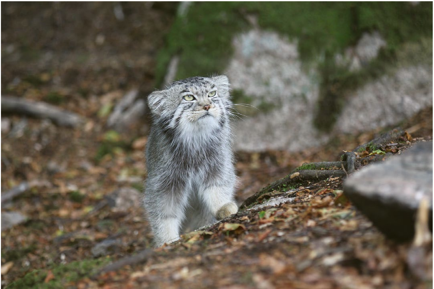
Pallas's Cat ( Otocolobus manul )

Number of new global Red List assessments completed: 1