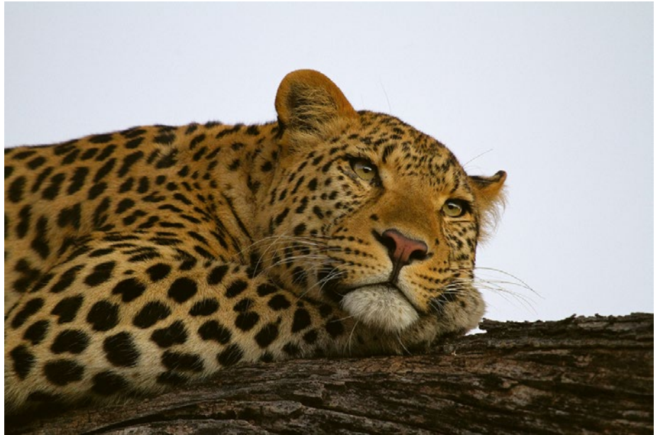
Leopard ( Panthera pardus )

which took place on 23-29 April 2023 in Entebbe, Uganda. The Cat SG contributed to species banners produced by the Royal Zoological Society of Scotland for the side event on the Silk Road Cats at CMS COP 14, February 2024, in Samarkand. The Cat SG has attended the Animals Committee and Standing Committee meetings of CITES. We have also authored documentation for African Lions as part of the work programme for the Joint Cites-CMS African Carnivore Initiative (e.g., the Northern Lion Action Plan and supporting information reviewing how NDFs are applied to lions).