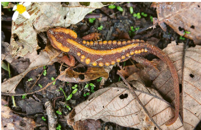
Tylotriton shanjing in Yuanyang, Yunnan, China

T-041 Protect Chinese Horseshoe Crab and its habitat along the Fujian coast. [Implementer: WENG Chaohong] Status: On track