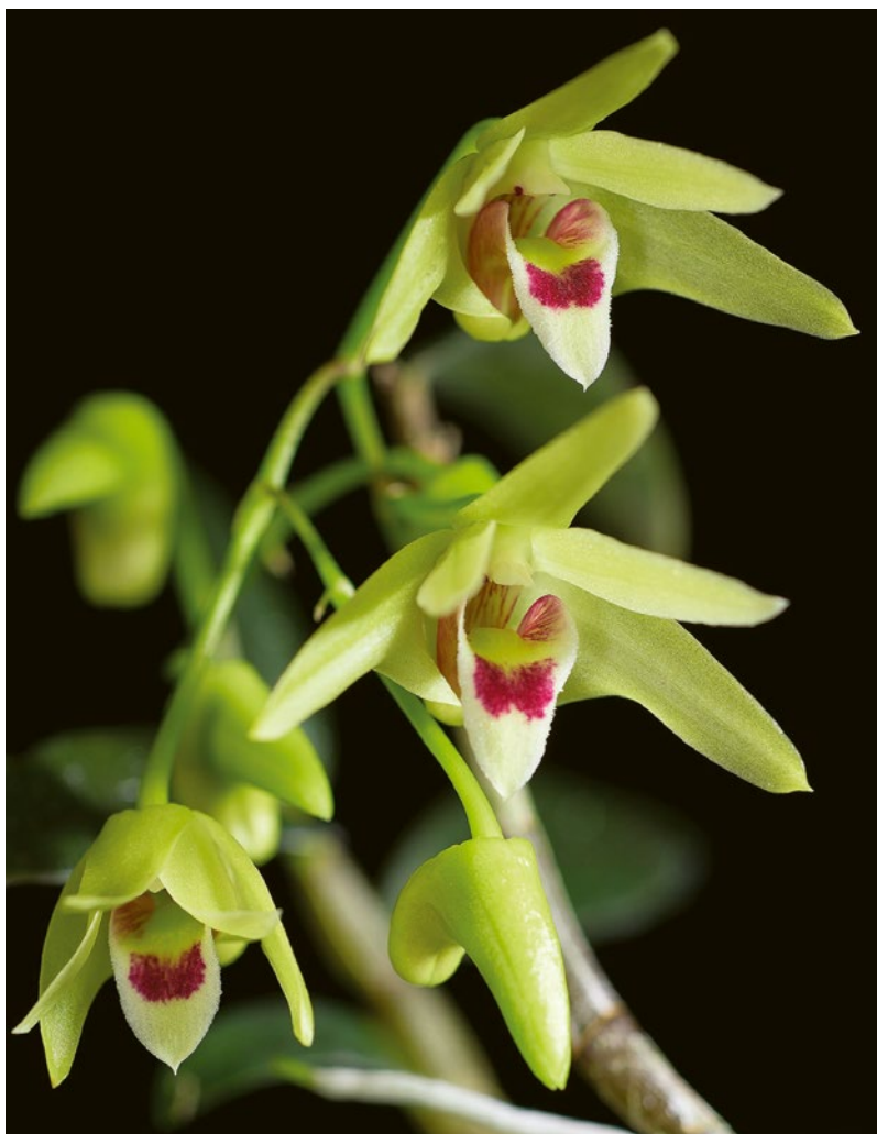
Dendrobium officinale from South China

T-038 Conduct conservation of Horseshoe Crab in Guangdong. [Implementer: XIE Xiaoyong] Status: On track