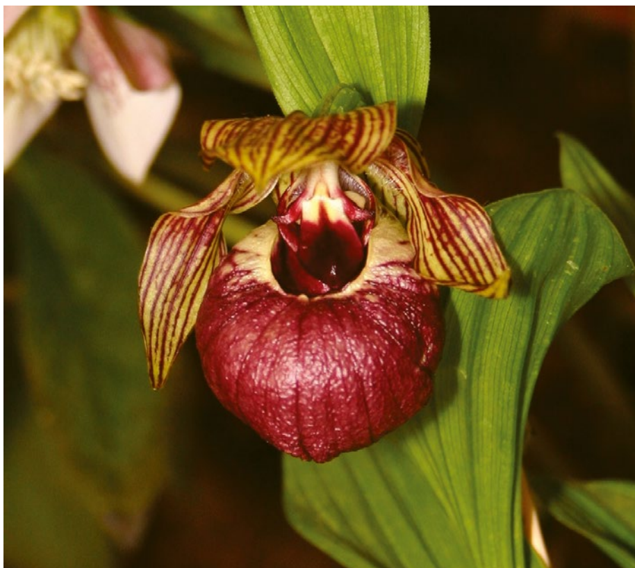
Cyripedium tibeticum

T-046 Establish a ChSSG/Freshwater fish task team. [Implementer: ZHAO Yahui] (KSR 2)