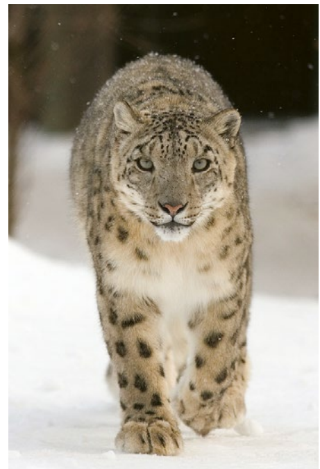
A Snow Leopard ( Uncia uncia )

Result description: In 2023, 17 species of birds were newly recorded in Zigong (including two species of Level I and two species of Level II in the National Key Protected Wild Animal List of China), together with three species of reptile ( Plestiodon capito , Achalinus spinalis , Sibynophis chinensis ).