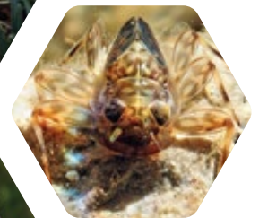
Mayfly nymph ( Ecdyonurus sp.)