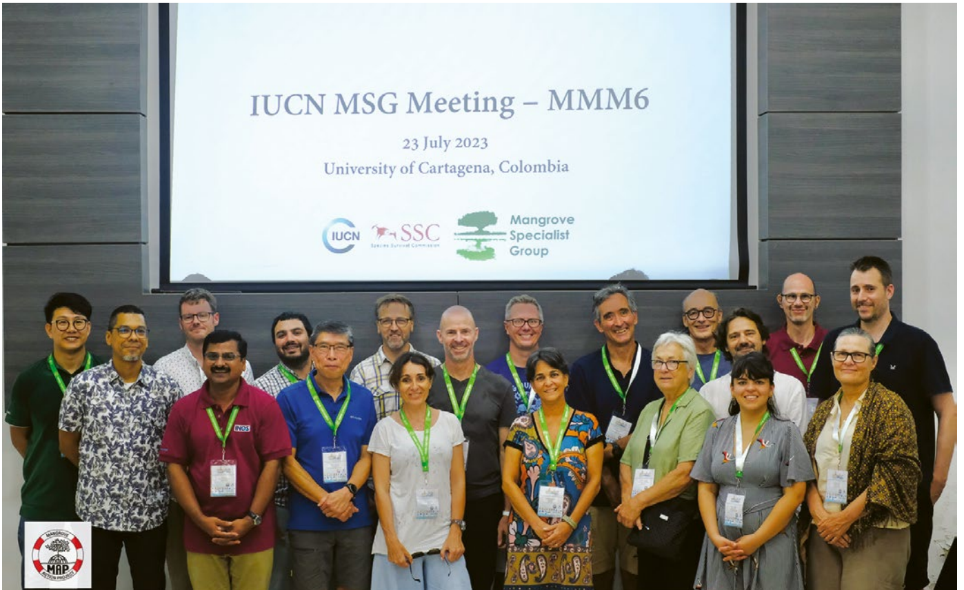
Mangrove Specialist Group meeting, July 2023