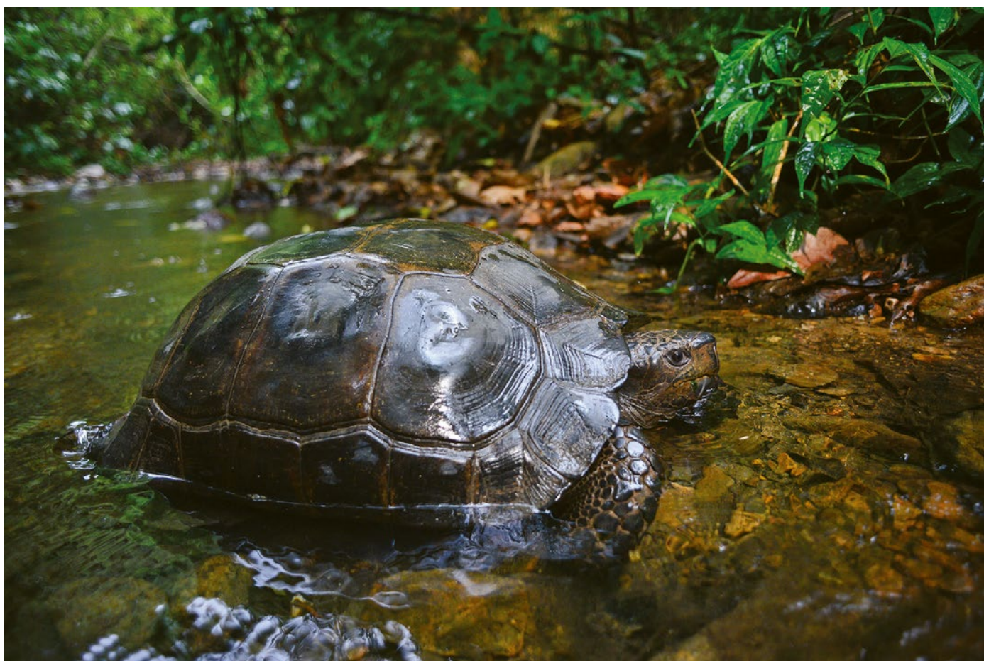
Asian Giant Tortoise ( Manouria emys) in the Kaeng Krachan National Park