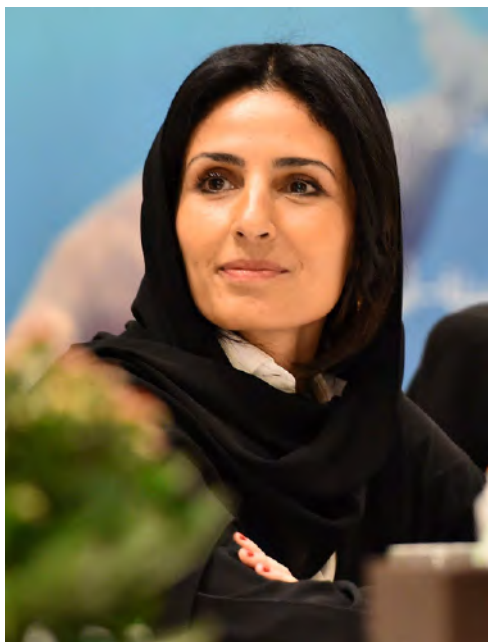
H.E RAZAN AL MUBARAK