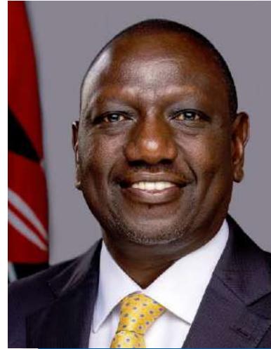
H.E. DR. WILLIAM SAMOEI RUTO, C.G.H

H.E. DR. WILLIAM SAMOEI RUTO, C.G.H, PRESIDENT OF THE REPUBLIC OF KENYA