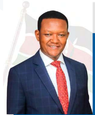
DR. ALFRED MUTUA

WELCOME MESSAGE FROM DR. ALFRED MUTUA, CABINET SECRETARY FOR TOURISM AND WILDLIFE, KENYA