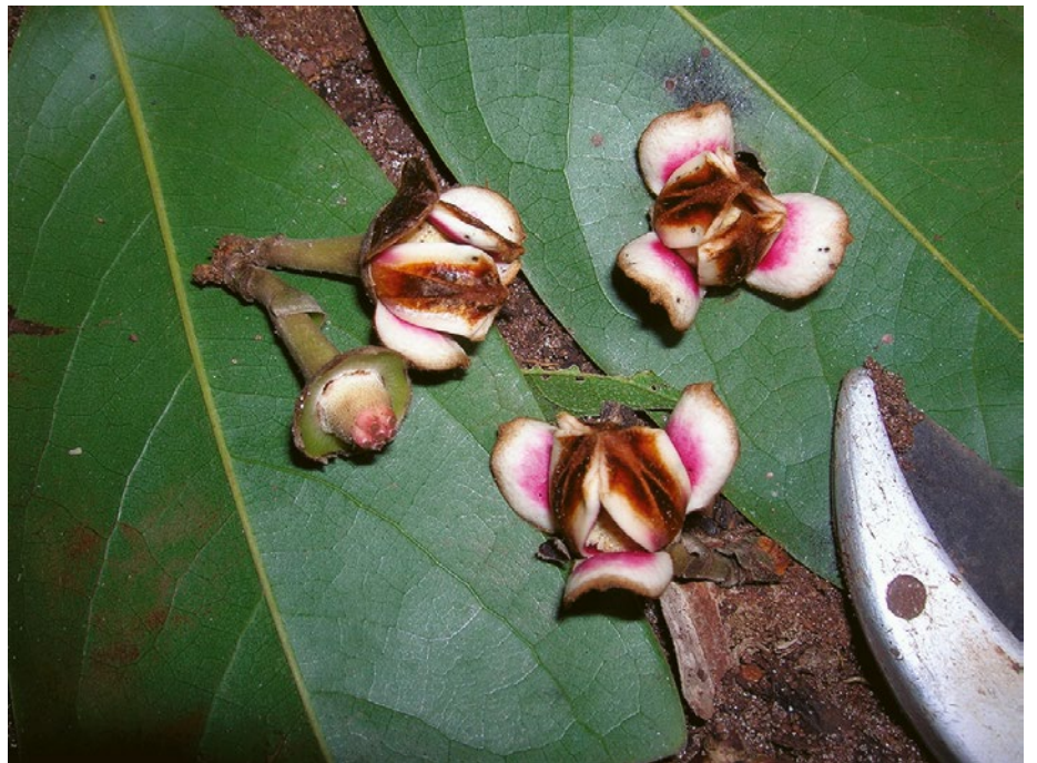
Uvariadendron schmidtii Q.Luke, Dagallier & Couvreur (Annonaceae)