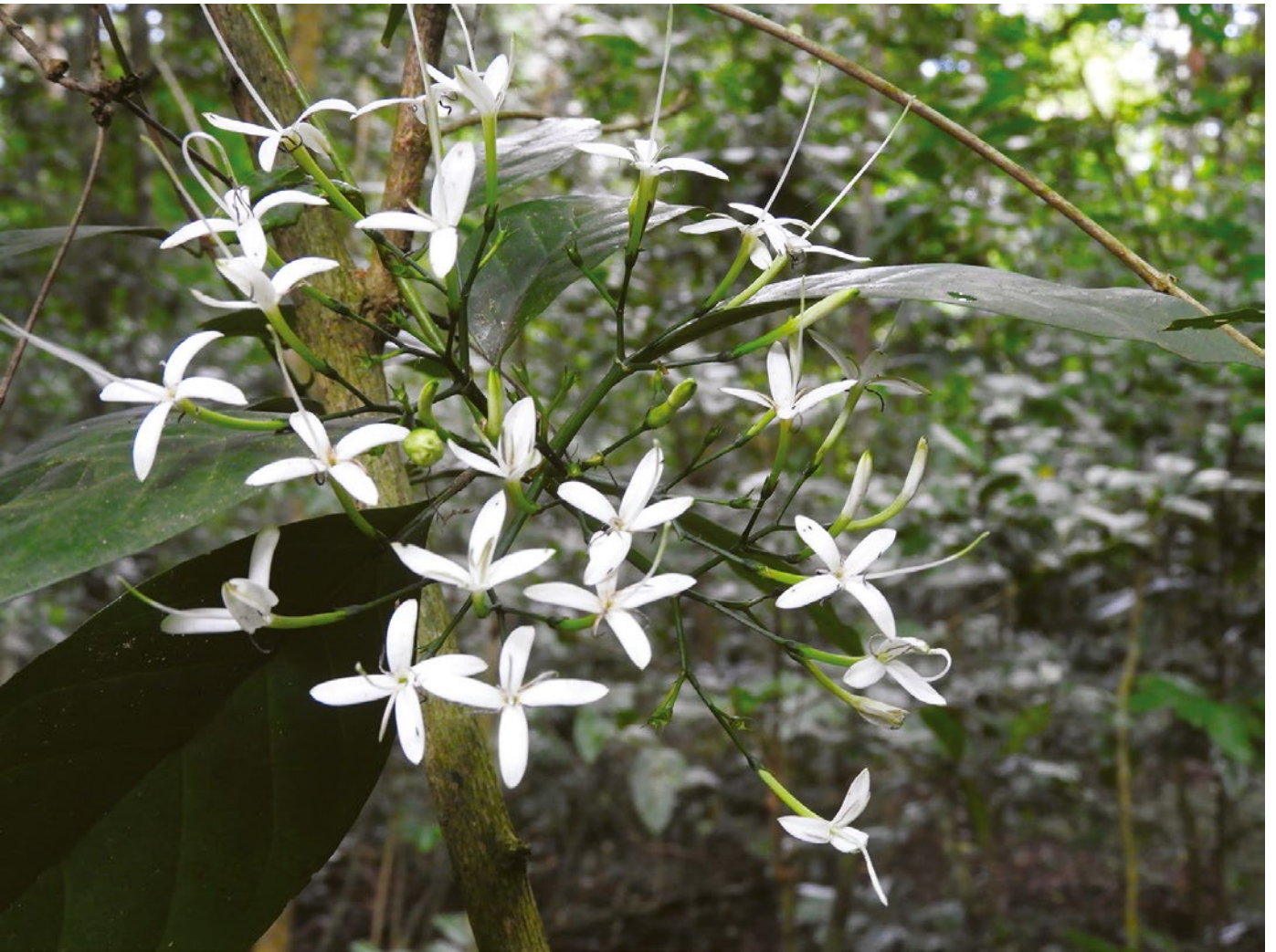
Pavetta tarennoides S.Moore (Rubiaceae) endemic to Kenya and assessed as Critically Endangered in the IUCN Red List of Threatened Species