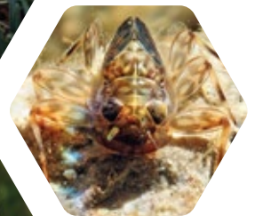
Mayfly nymph ( Ecdyonurus sp.)