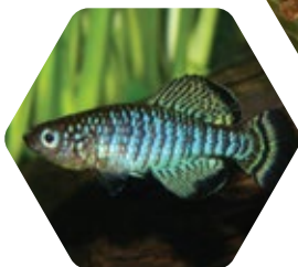
Nothobranchius fuscotaeniatus