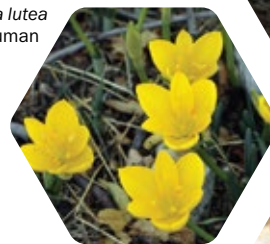
Sternberia lutea