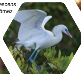
Egretta rufescens