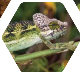
Trioceros hoehnelii