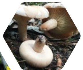
Lactifluus neotropicus