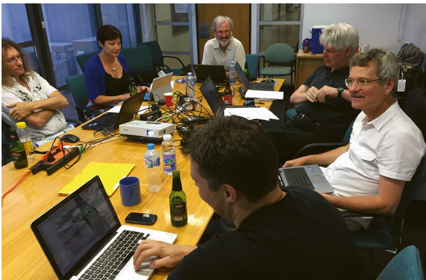
Standards and Petitions Committee at a meeting in November 2015 at the University of New South Wales, Sydney, Australia