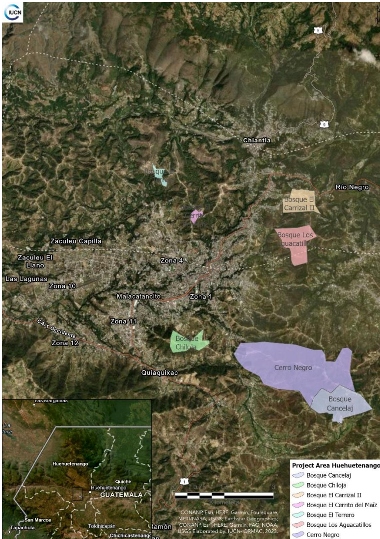
Map 2: Huehuetenango city

Huehuetenango city managers have put forward a vision for sustainable development of the region, articulated in three plans: the Municipal Development Plan 2011-2025 , the Municipal Plan for Local Economic Development and Adaptation to Climate Change (2019-2023) , and the Municipal Development and Land Use Plan of the Municipality of Huehuetenango, 2019-2032 . The municipality has also partnered with the Guatemalan NGO Foundation for Ecodevelopment and Conservation (FUNDAECO), the National Council of Protected Areas (CONAP) and the National Forest Institute (INAB) to establish the Zac'ulew Municipal Ecological Belt , as a strategy for limiting urban sprawl and protecting biodiversity. To date, 10 areas have been prioritized, totaling more than 500 ha of surface area.