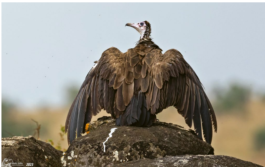
Hooded Vulture ( Necrosyrtes monachus ) Immature - CR, Apoka Kidepo Valey National Park, Uganda, March 2023

the West African Vulture Conservation Action Plan; (3) Review and update of the Egyptian Vulture Flyway Action Plan; 4) Drafting and publication of National Vulture Conservation Action Plans in Kenya, Botswana, Tanzania and South Africa; (5) Annual update of the regional SAVE Blueprint for South and SE Asia.