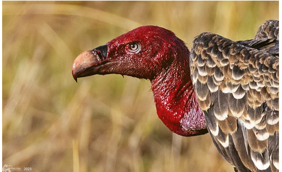
Rüppell's Vulture ( Gyps rueppelli ) - Adult - CR, Apoka, Kidepo Valey National Park, Uganda, March 2023

T-009 Promote International Vulture Awareness Day each September. (KSR 13) Number of organizations that participate in the International Vulture Awareness Day: 96