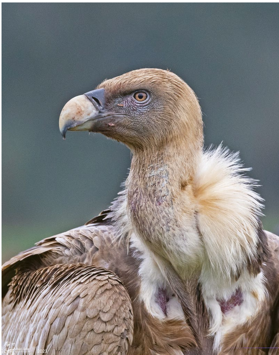
Eurasian Griffon ( Gyps fulvus ) - Ad - LC, El Millaron, Spain, November 2023

Result description: The African Wildlife Poisoning Database is functioning well and currently holds data on almost 1,600 wildlife poisoning incidents from across the continent. The South Asian mortalities database has been initiated under the auspices of the SAVE consortium. No progress in the Americas to date.