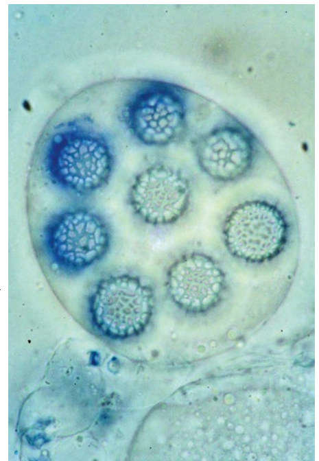
Microscope image of ascus and ascospores of the desert truffle Terfezia alshekhii

Result description: Ten desert truffle species description sheets have been completed and are published on CABI's website. Further work will be done in 2024 to translate this information into a format compatible with the IUCN Red List of Threatened Species.