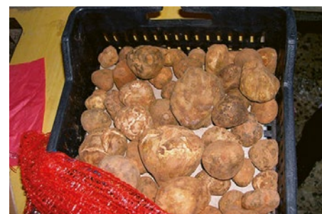
Desert truffles from the Terfezia genus being sold in a local market in Abu Dhabi

T-004 Produce a document listing recommended sources of information for assessing non-lichen-forming ascomycetes. (KSR 7)