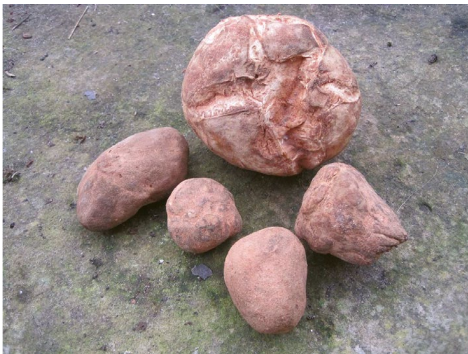
Ascomata of desert truffle Terfezia sp.