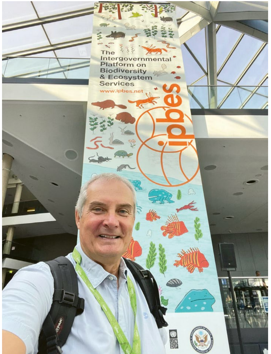
Chair of ISSG at IPBES plenary, where the Thematic assessment on IAS was adopted