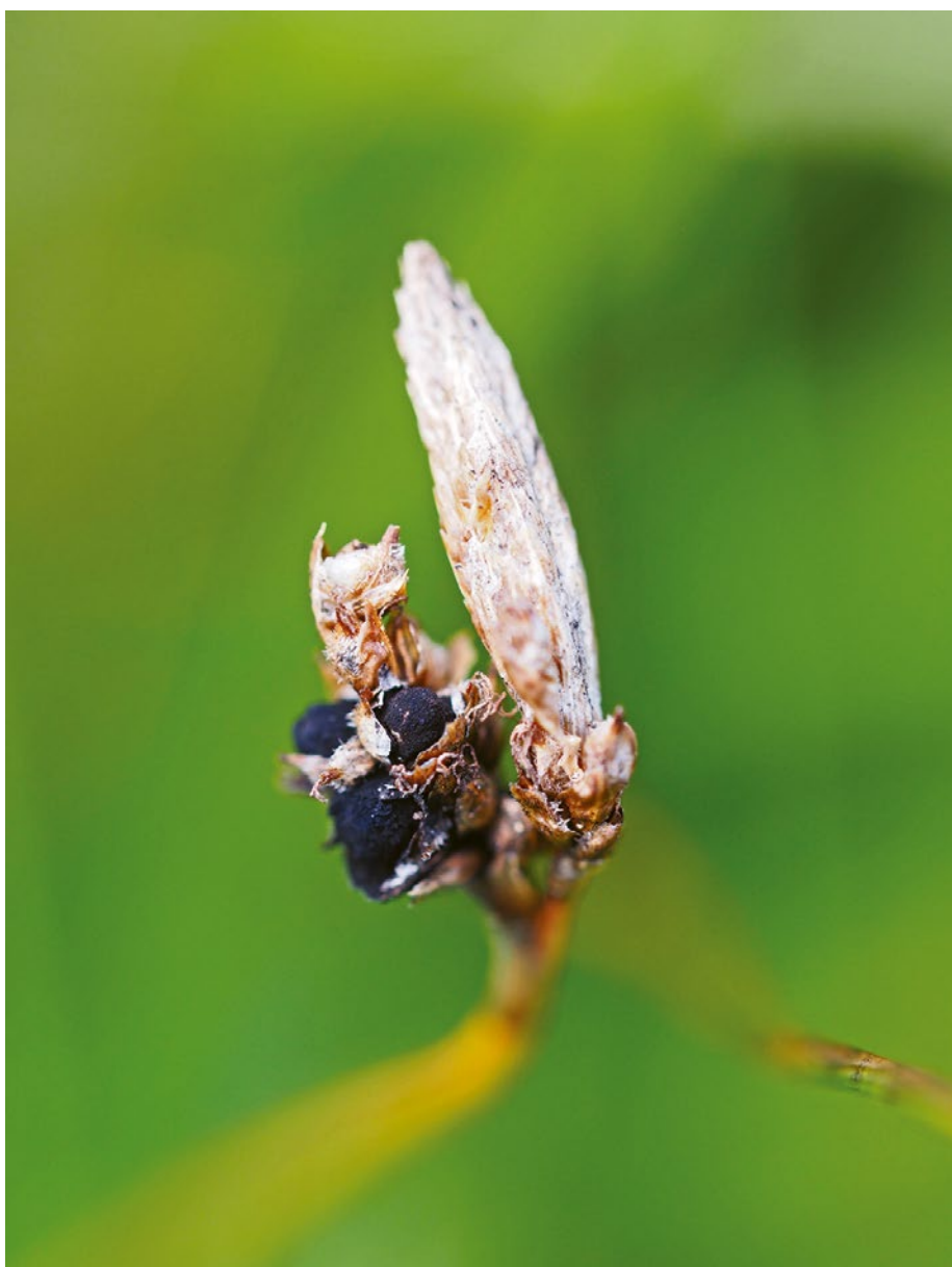
Anthracoidea umbrosae T. Denchev, Denchev, Begerow & Kemler, Bulgaria