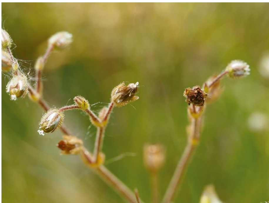
Microbotryum duriaeanum (Tul. & C. Tul.) Vánky, Bulgaria