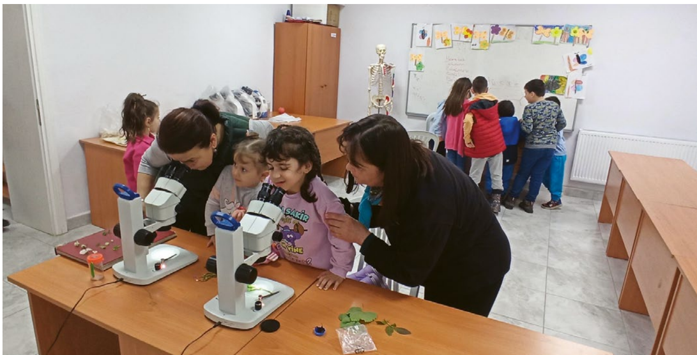
Microscope activity at the Nature School in Samsun, Turkey

T-007 Contact five new organisations outside the SSC to seek their cooperation in pursuing specific conservation and/or educational outcomes. (KSR 2)