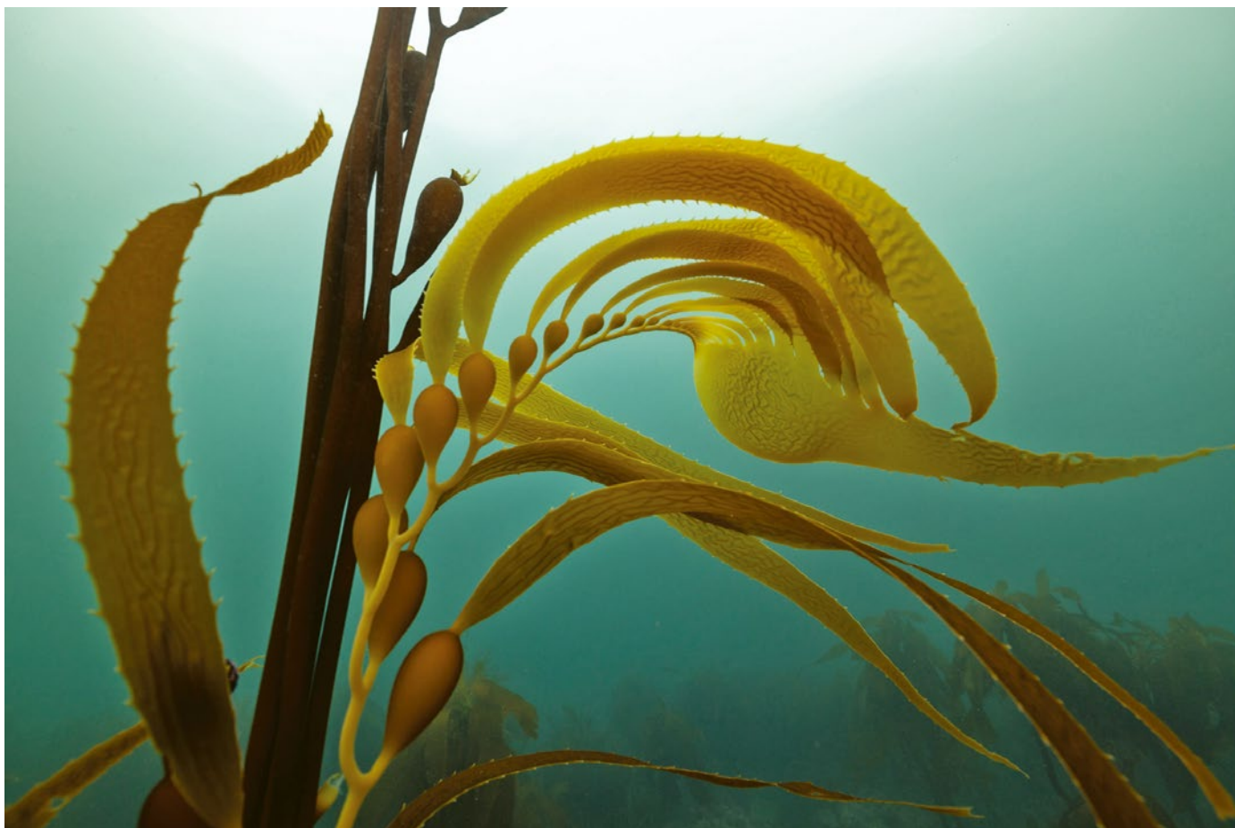
Macrocystis pyrifera