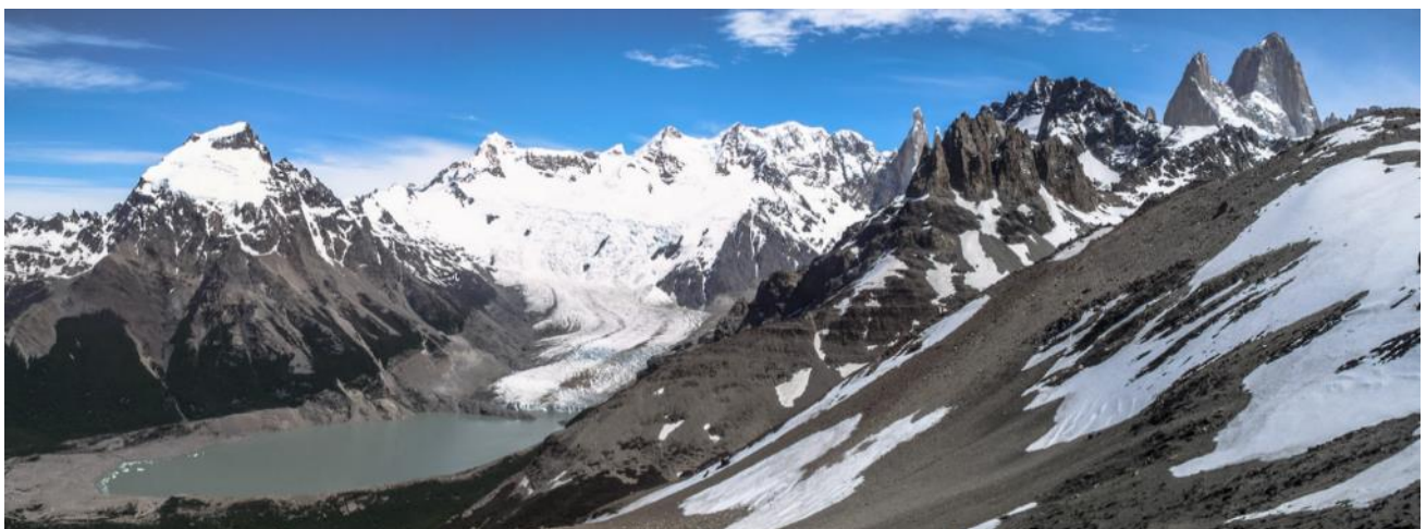
Figure 1: Examples of protected areas recognised wholly or substantially for their geodiversity. a Siccar Point Site of Special Scientific Interest, UK. The site vividly demonstrates a 55-million-year discontinuity in the geological record between two different sets of rocks and was discovered by geologist James Hutton in 1788; it supports Hutton's theory of deep time and Earth's long and dynamic geological history b The Swiss Tectonic Area Sardona, Switzerland, is inscribed on the World Heritage list under criterion viii. A key site for geological research, it has contributed significantly to understanding the dynamics of plate tectonics, continental collision and the formation of the Alps. Image shows a horizontal feature exposed in the landscape; a tectonic structure known as the Glarus thrust. c Los Glaciares National Park, Argentina, with the largest ice cap outside of Antarctica and Greenland, approximately 2,600 km 2, associated with a diverse range of geomorphological processes, glacial features and subject to a changing climate. Image shows Laguna Torre