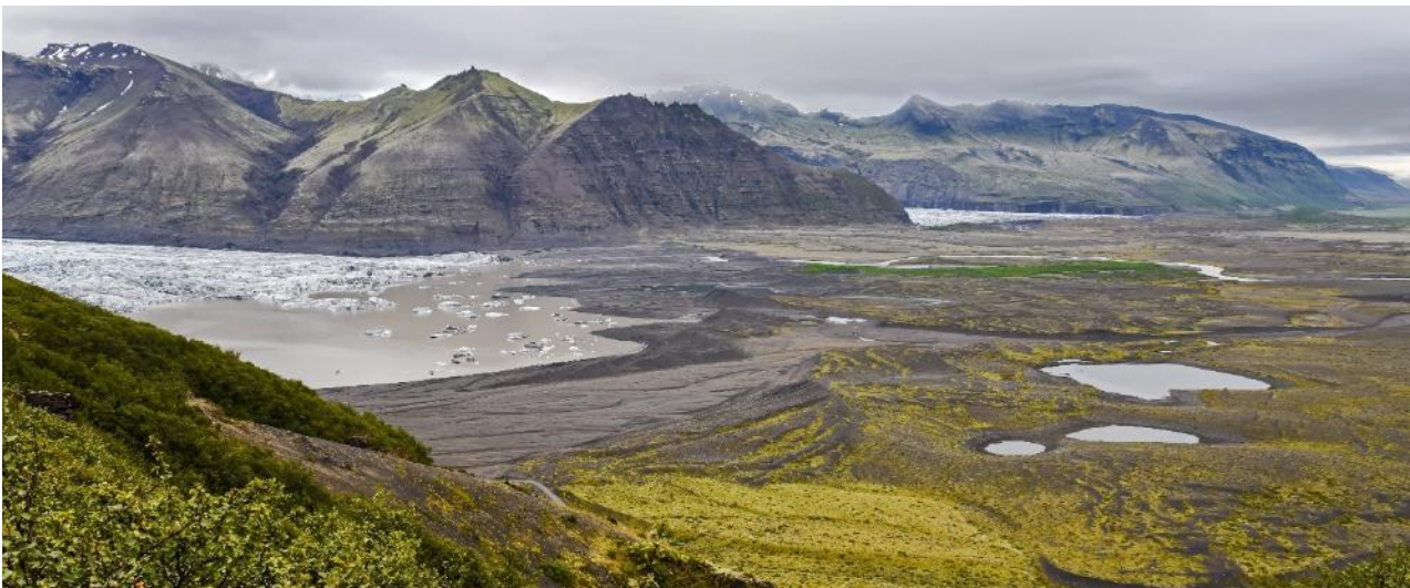
Figure 6: Glacier retreat resulting from climate change provides new habitats and space for the spread of native tree and shrub species, particularly birch and willow, on expanding glacier forefields.

A region with high geodiversity provides a mosaic of niches and habitats, that can be further multiplied by seasonal fluctuations of abiotic processes or extreme events within the same location (Parks & Mulligan, 2010). Areas of high abiotic diversity can therefore contribute to the resilience and adaptation of biodiversity to climate change by providing environmental connections or climate refugia (Hjort et al., 2015). Likewise, faced with extreme winds, changing precipitation patterns or floods, the resilience of the geosphere can be strengthened by biological diversity, for example through the resistance to coastal erosion provided by mangroves (Menéndez et al., 2020). Furthermore, integrated conservation can ensure that organic soils, peat, and coastal and marine ecosystems and sedimentary systems continue to play an important function in climate regulation through their role in carbon sequestration and storage (Atwood et al., 2020; Beaulne et al., 2021; Beaumont et al., 2014; Smeaton et al., 2021).