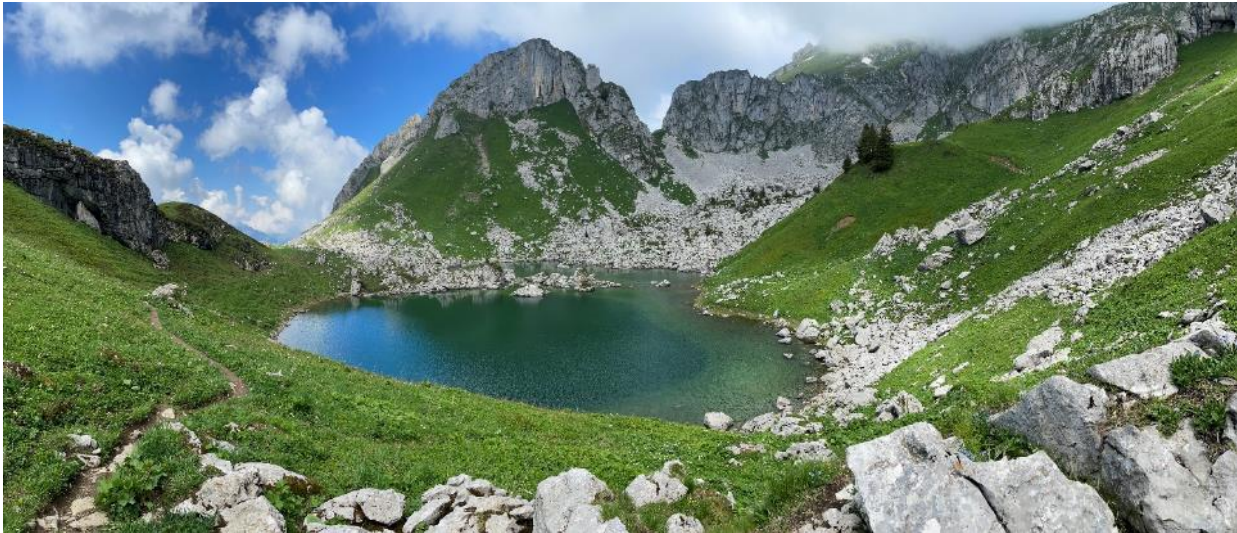
Figure 5: The dynamic landscape of Lac Darbon where a glacial cirque and recent rock falls form a mosaic of habitats, Chablais UNESCO Global Geopark, France.