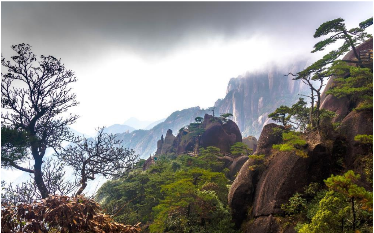
Figure 8: Sanqingshan UNESCO Global Geopark and natural World Heritage site, Jiangxi Province, China, is noted for its granite pillars and peaks, forested slopes and aesthetic and atmospheric qualities. It supports a rich biodiversity and cultural heritage interests.

Another component of geodiversity, groundwater, is managed to support human activity. Generalised, persistent subsidence due to anthropogenic action, notably extraction, is well documented (Karegar et al., 2016), with studies identifying impacts on biodiversity, economy, and society (Keith et al., 2020; United Nations Environment Assembly, 2022). Degradation of biotic communities, such as grassland ecosystems, can influence the quality of groundwater (Guo & Chen, 2024). The incursion of saline waters, loss of aquifer storage capacity, habitat loss, rising sea level as well as exposure to extreme weather events can have far-reaching and persistent consequences on ecosystems and biodiversity. Earth system assessments do not incorporate this type of driver (Ohenhen et al., 2023). An integrated definition of nature would support a more comprehensive approach to investigate and understand the natural world and wise use of non-renewable resources.