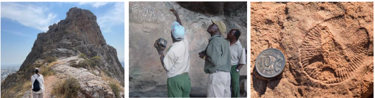
Figure 7: Geodiversity supports huge spiritual and cultural values, often in areas also famous for their biodiversity. Pictures show Sulaiman Too sacred mountain and World Heritage site in the middle of the city of Osh, Kyrgyzstan, petroglyphs in Nyaka National Park, Malawi (both © Equilibrium Research) and a fossil animal, Dickinsonia , at Nilpena fossil site, Ediacara Conservation Park, South Australia, © Graeme Worboys.

The separation of people and nature observed in Western civilisation has generally not occurred in other world cultures. However, Western traditions have influenced international management practices, and the institutional need to reconcile cultural and natural conservation is recognised in IUCN Resolution 033 (2013). Not only does IUCN explicitly represent nature as a whole, as evidenced by the title of the organisation, so too is recognition of the fundamental contribution brought by the views and practices of many Indigenous Peoples towards the natural world, that fall outside the bounds of traditional conservation ecology (Verschuuren et al., 2021). It may be argued that the ambition to develop stronger links between culture and nature can be accelerated by using a fully comprehensive definition of nature, that embraces the importance of non-living diversity (Ducarme & Couvet, 2020). For example, many natural features such as rock outcrops and caves have sacred values and cultural meanings (Crofts et al., 2020; Kiernan, 2015), while many also have been sources of inspiration for art, literature and poetry and provided the foundation for landscape character and people's sense of place (Gordon, 2018; Reynard & Giusti, 2018)..