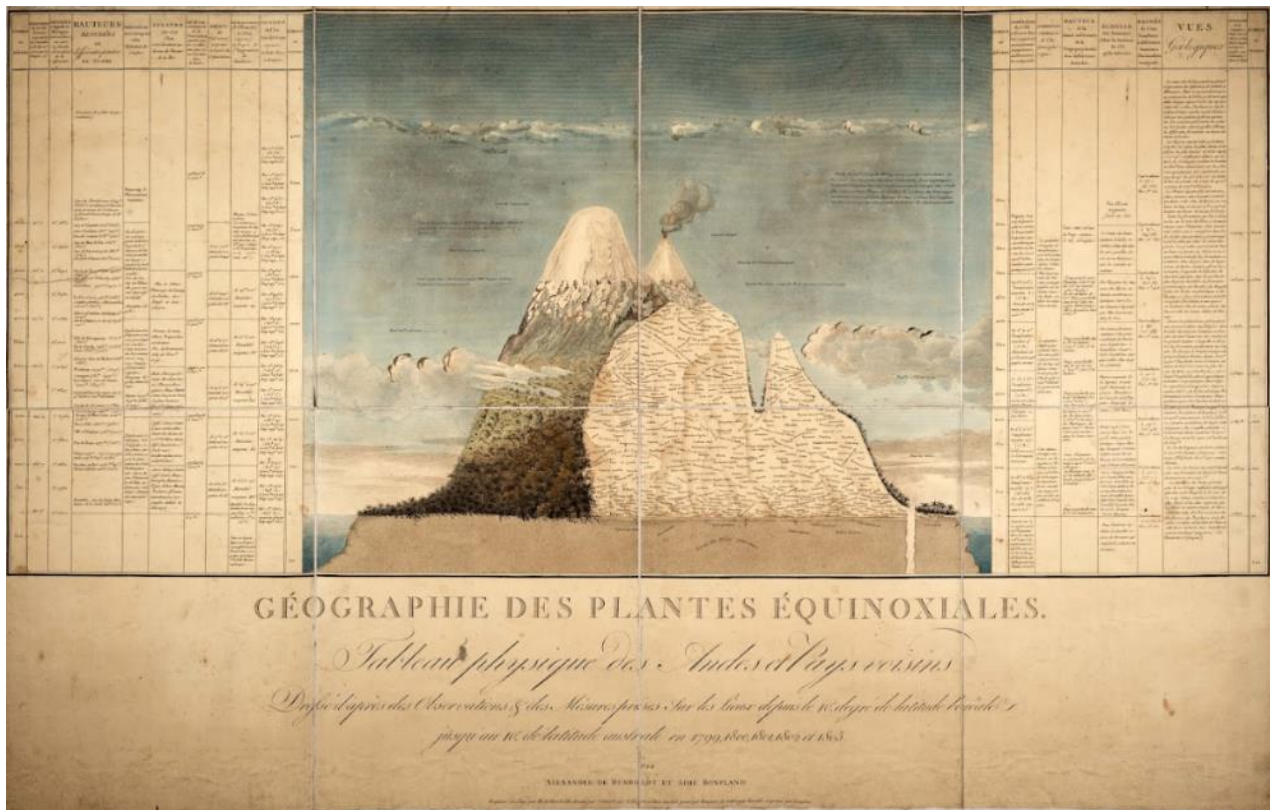
Figure 2: Physical Description of the Andes and Neighbouring Regions by A. von Humboldt (von Humboldt & Bonpland, 1807). This figure shows how von Humboldt’s meticulous observations and illustrations laid the groundwork for understanding the geography, geology and natural history of the region.

This early natural science tradition firmly excluded the wider value and perception of nature derived from religious and philosophical traditions. Its proponents viewed the whole Earth as a system with many spheres, interconnections and relationships (Figure 2).